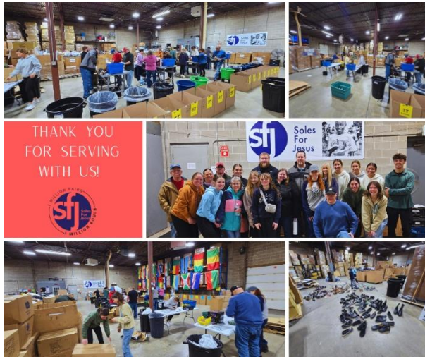
First Volunteer Group of the New Year!