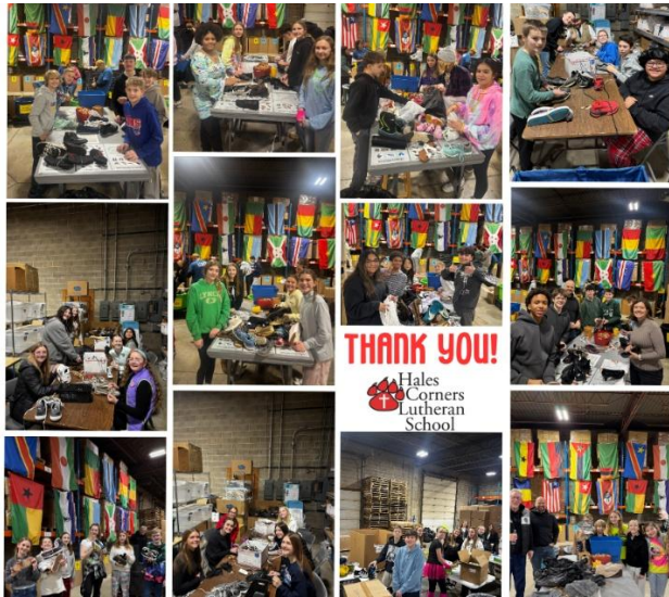
HCL Middle School Serve Day