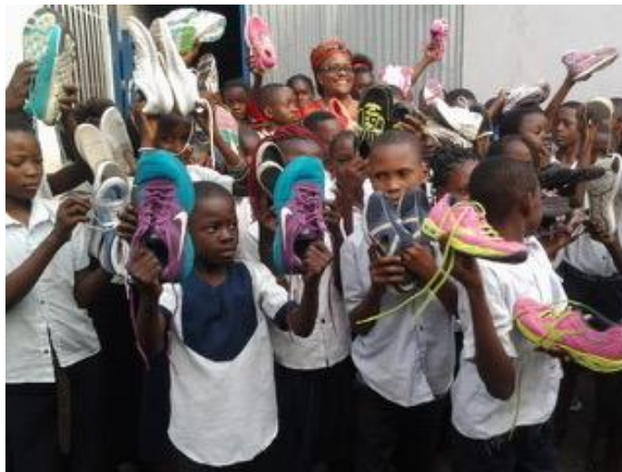
DRC West in 2019 & going back in 2026!