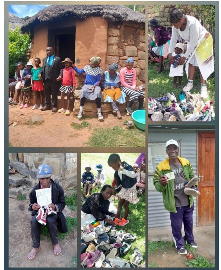
God's love is transforming lives in Lesotho