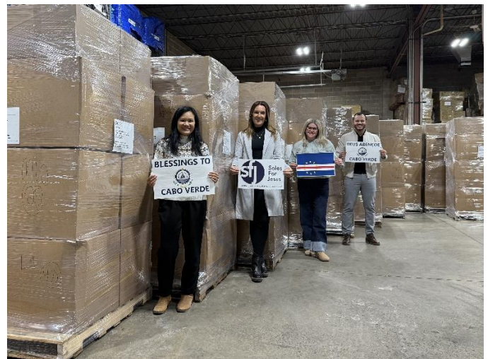
Blessings to the islands of Cabo Verde!