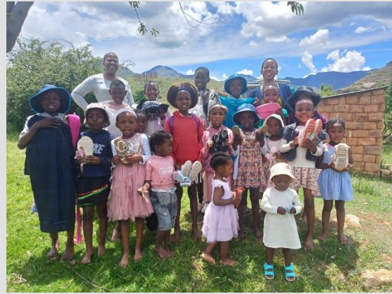
The love of God reaching Lesotho.