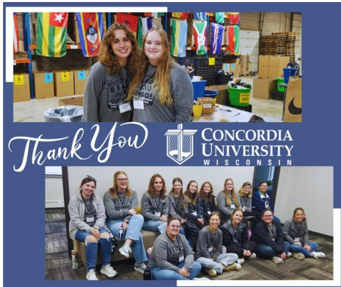
Ladies from the Beautiful Feet Conference

Concordia University - It was a joy to host these incredible women from across the country who were in town for the Beautiful Feet Conference at Concordia University! Thank you for serving and for being such a blessing.