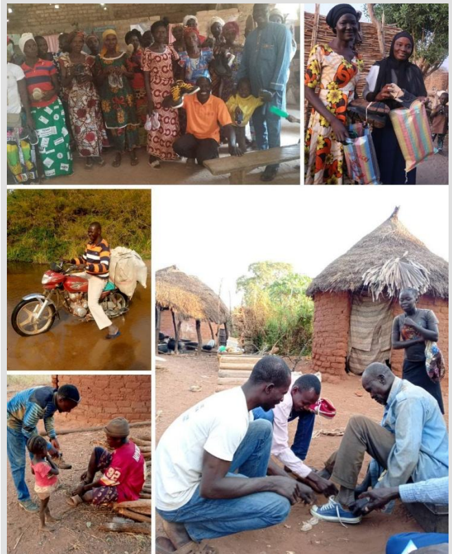
May God continue to bless Chad!