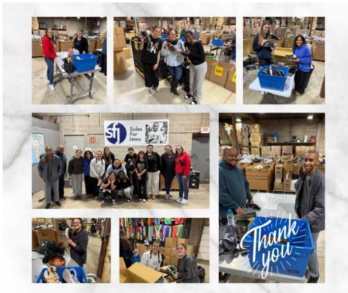
The next generation is on fire for Jesus!

Heritage Christian School - This fantastic group of senior girls from Heritage Christian School joined us to pack hundreds of shoes for our next shipment to Africa. Thank you for serving with so much passion and heart!