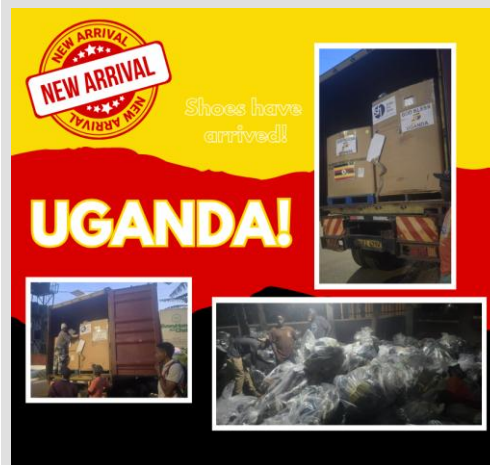
Team unloading the shoes at night!