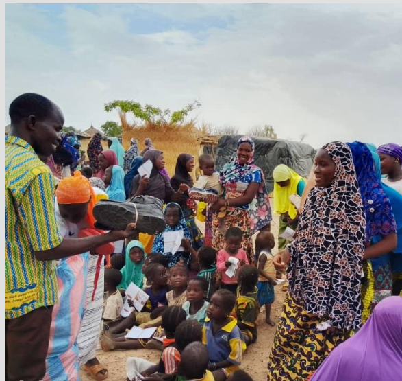
Shoes are a blessing in Burkina Faso.