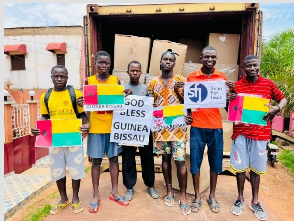
May God Bless Guinea Bissau