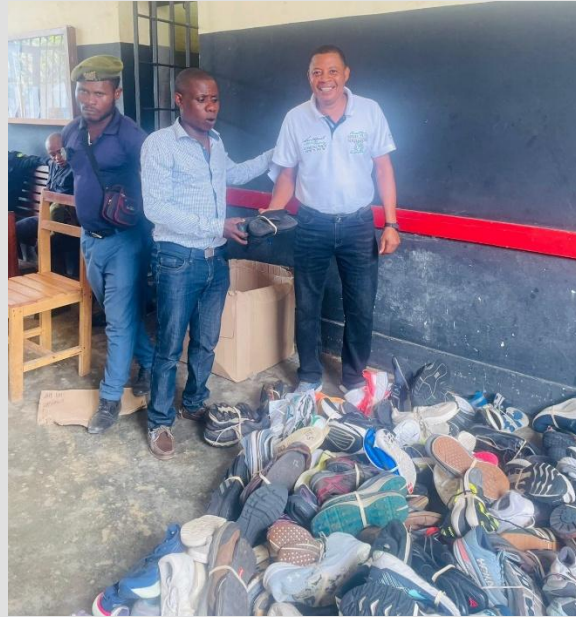
Jesus sets the prisoner free!