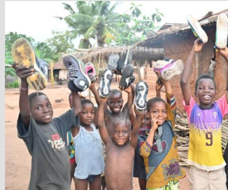
Peace in Togo