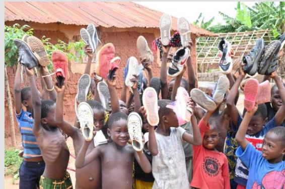
Click to Watch Video