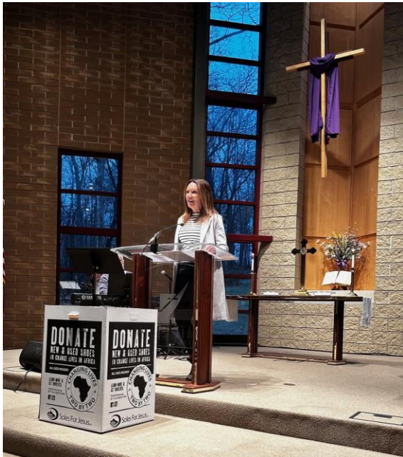
A New Collection Site at Fox River Congregational