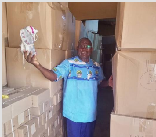
God's blessings to Burkina Faso!