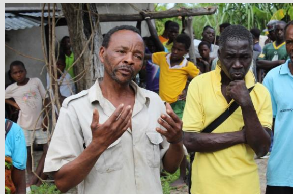
Sharing Jesus in Mozambique