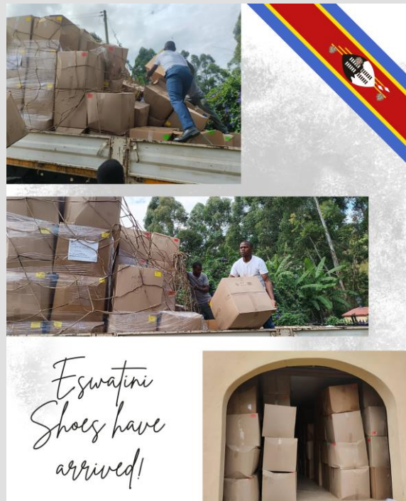
Prayers For Eswatini