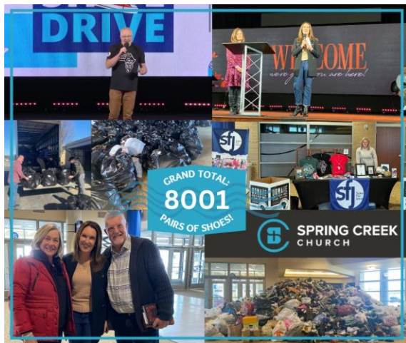
SCC conquered their goal of 8,000 pairs of shoes!

The final count of the Spring Creek Shoe Drive is 8,001 pairs! They exceeded their goal and more shoes continue to be dropped off. We are so moved by their radical generosity to fill and also fund this entire shipment to Cameroon. Thank you for stepping out in great faith and we can't wait to hear how God draws many into His Kingdom through this mighty act of love!