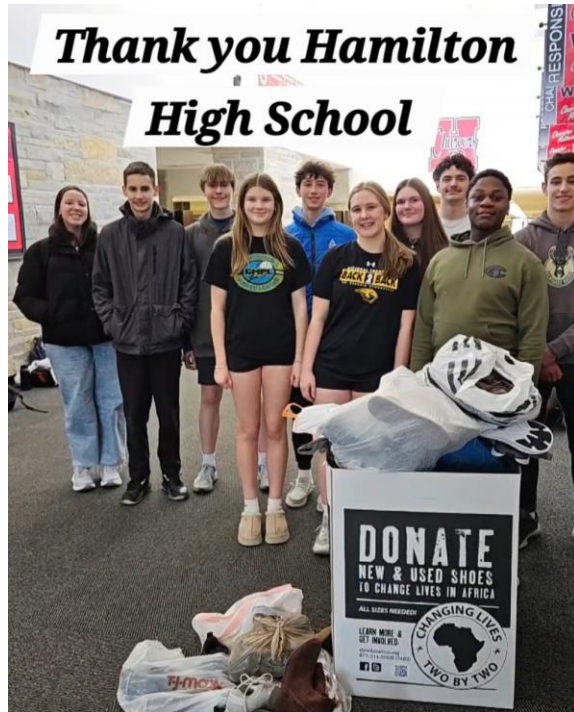
Students at Hamilton HS collecting shoes

We thank all of the great students at HHS for their ongoing support to collect shoes for Africa. What a joy to send their shoes to other kids and adults across the globe. Special thanks to Roberta Pratt for helping with the deliveries. Thank you all for your service and support!