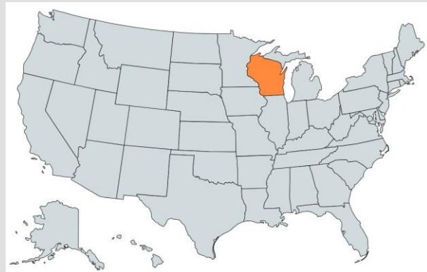
Please share with your out-of-state friends!

We love being able to celebrate the work that God is doing through SFJ with all of our friends across the nation! Will you be the first to represent your state by signing up for the Stroll Across America Challenge ? Grab your friends, family, or neighbors and walk to support lives being changed in Africa through the gift of shoes given in the name of Jesus. Help us light up the map by registering today to represent your home state!