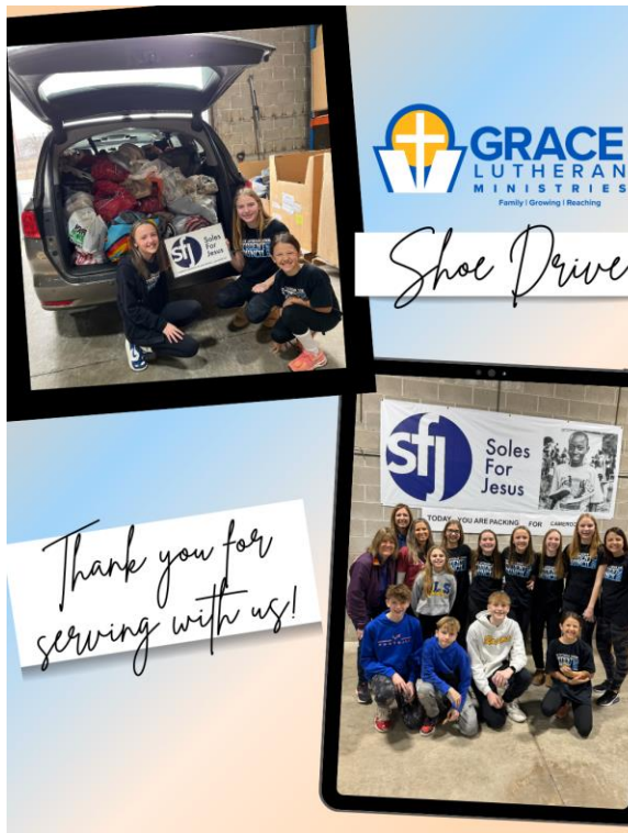
Grace Lutheran serving with us