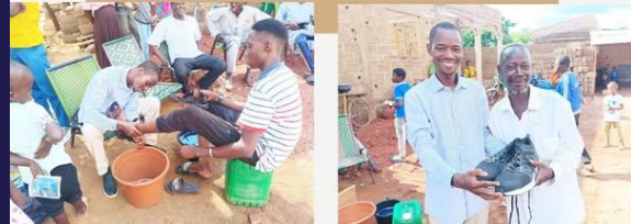
Demonstrating God's Love in Mali