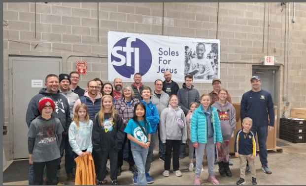
"Dad Lab" Group from Spring Creek Church