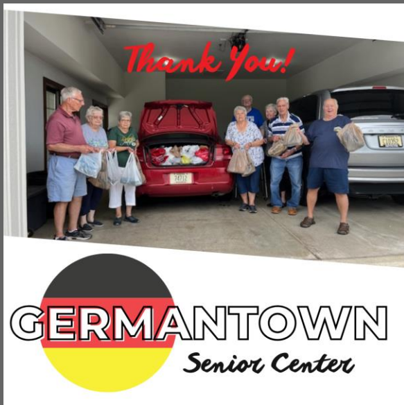
Germantown Senior Center Shoe Drive