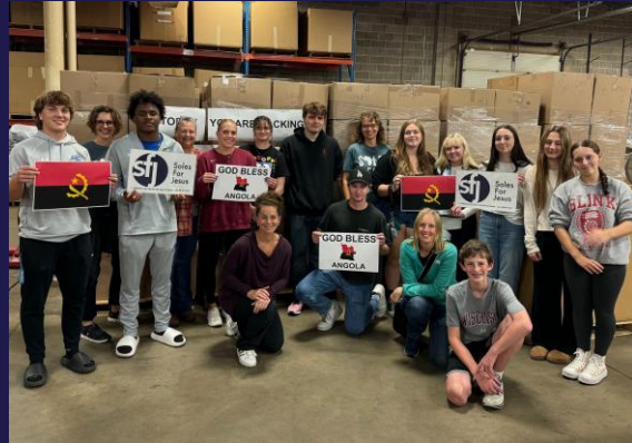
Love and Shoes to Angola

these shoes. We pray God's blessings over them and that all of their efforts will be fruitful.