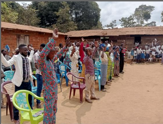
Saying "Yes!" to Jesus in Mozambique.