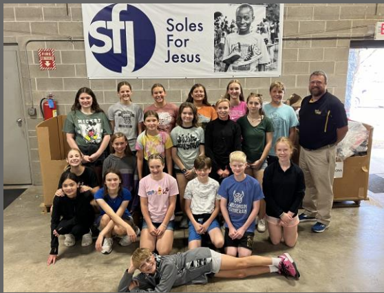
Thank you St. Paul's Lutheran in Franklin