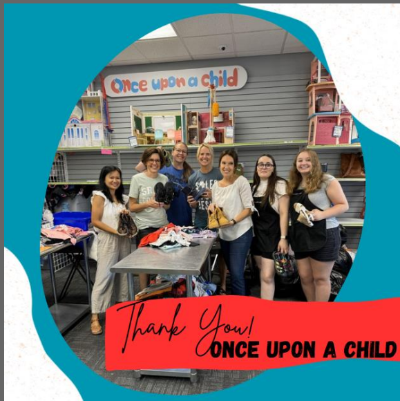
Picking up shoes at Once Upon A Child

Once Upon A Child, Brookfield - We are so thankful for our partnership with Once Upon A Child. They collect kids shoes year-round for us. This is an answer to prayer as we're finalizing our shipment to Eswatini and the last boxes to fill are for the children!