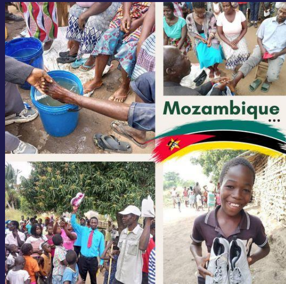
The love of Jesus in Mozambique!