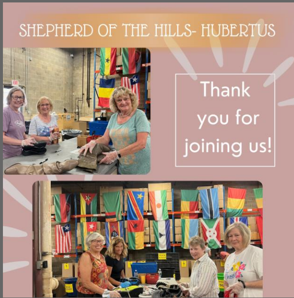
Thank you, ladies, for serving

Shepherd Of The Hills, Hubertus - We are so blessed by the Ladies Bible Study group from Hubertus for joining us again. They delivered over 150 pairs of shoes and helped us pack them for our next shipment to Africa!