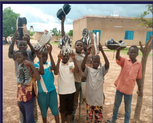
God is moving in Burkina Faso!