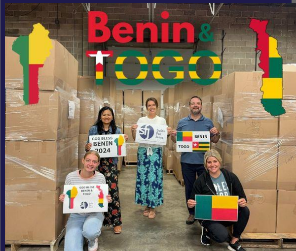
God's blessings to Benin & Togo!