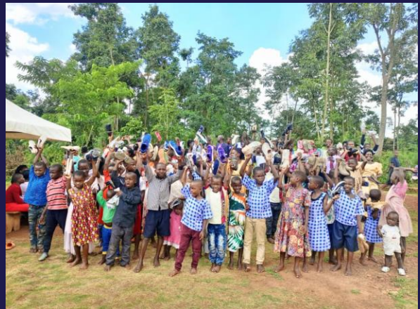
Jesus is glorified in Uganda