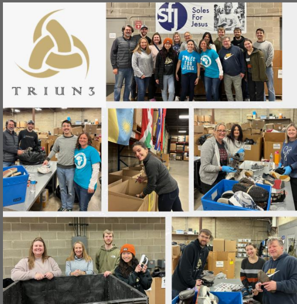
Triun3 serving on Maundy Thursday