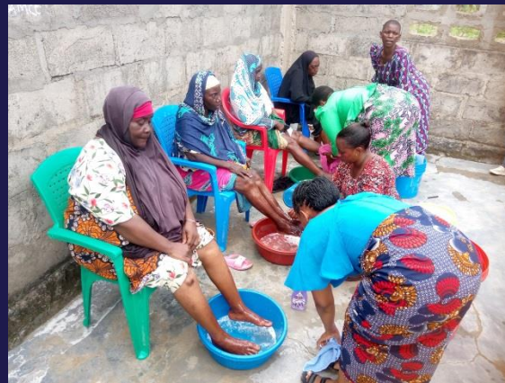
Demonstrating God's love in Tanzania