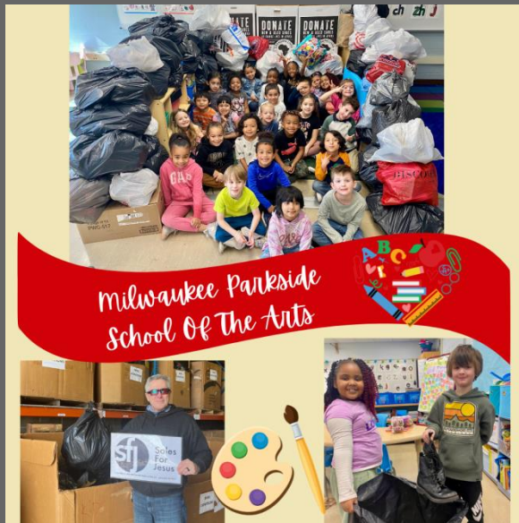
Thank you MKE Parkside School