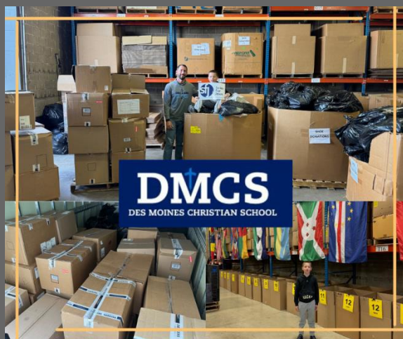
Shawn & Sam delivering shoes

delivering them from Iowa. Two full pallets and three shipping gaylords full of shoes (pictured) are ready to be packed by our volunteers. God bless you all for your ongoing partnership to touch lives in Africa!