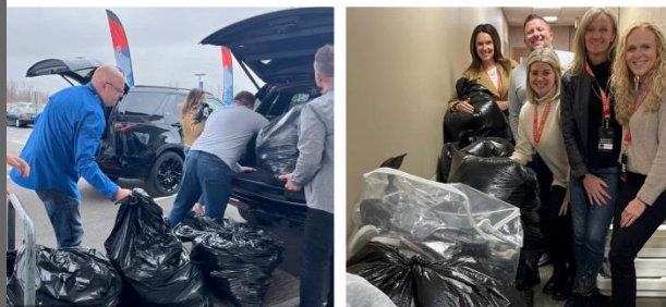
ReCourage Conference & Upward shoes

Triun3- What a privilege to have Triun3 serve in our warehouse during Holy Week. They asked to serve on Maundy Thursday, in honor of when Jesus demonstrated His love and humility by washing the disciples feet at the last supper. We are thankful for our partnership with Triun3 and may God bless you all.