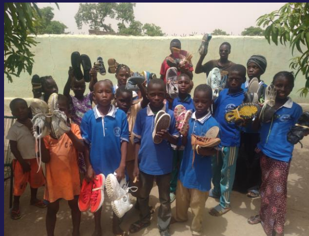
Blessings to Mali