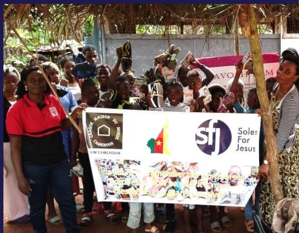
Finding new life in Jesus!