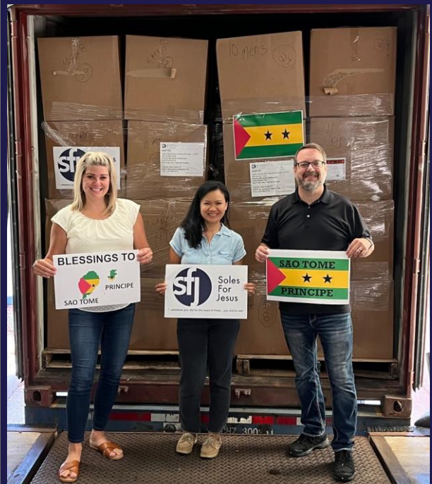
Love & prayers for Sao Tome & Principe