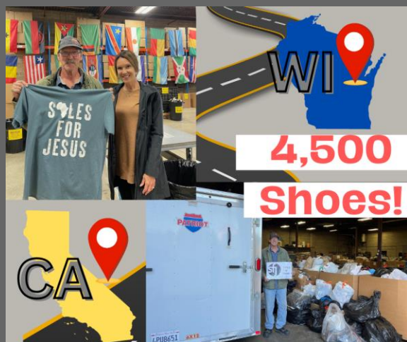
Shoes from California

collaboration to provide these gifts of hope for Africa and God bless you all!