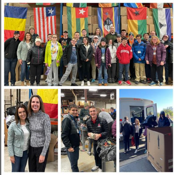
Serving with Journey21