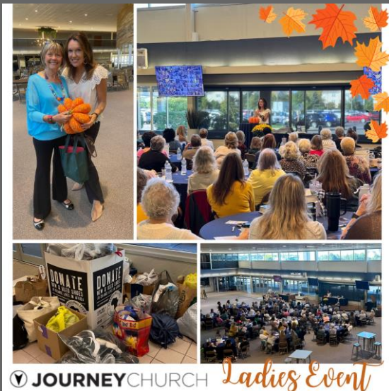
Y JOURNEYCHURCH Ladies Event Journey Church in Kenosha

being surrounded by beautiful ladies who have a heart to pursue God in every season of life. We are so grateful for the ongoing love, support and shoes that you give year-round!