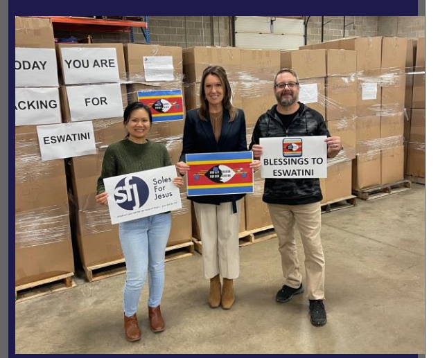
Love and blessings to Eswatini