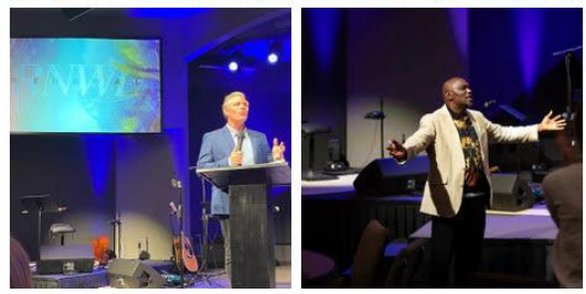
EHC Summit 2023