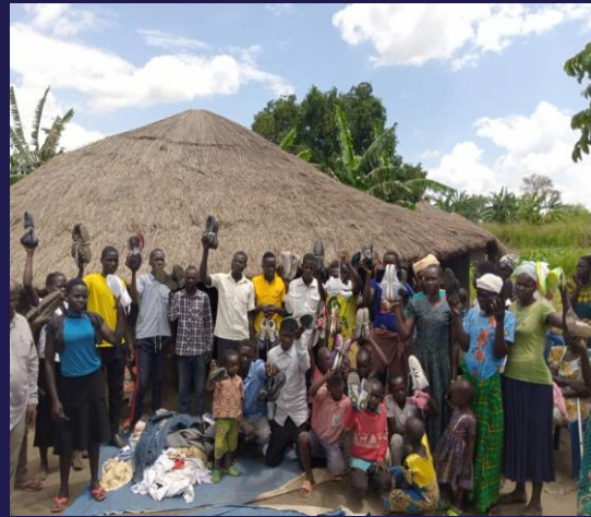
Sharing God's Love in Uganda