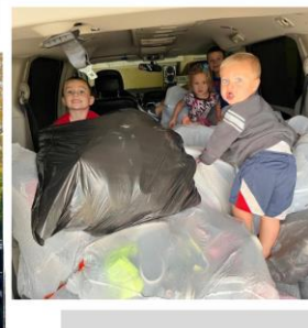
Great team work in Appleton