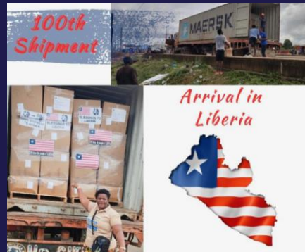
God bless Liberia!