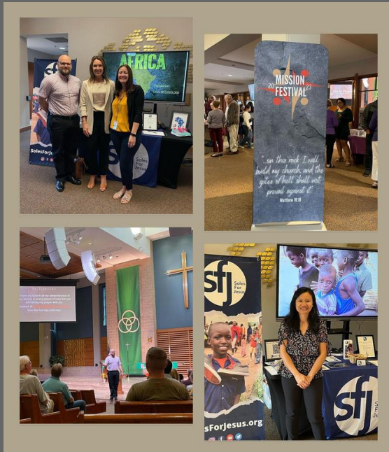
HCLC Mission Festival