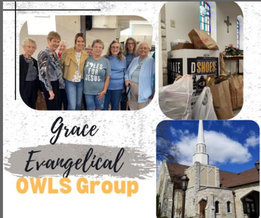
OWLS Shoe Drive & Luncheon

churches also collected shoes and came together for this great time of sharing and fellowship. Thank you to each person who attended and collected shoes. God bless you all for making an impact across the globe!