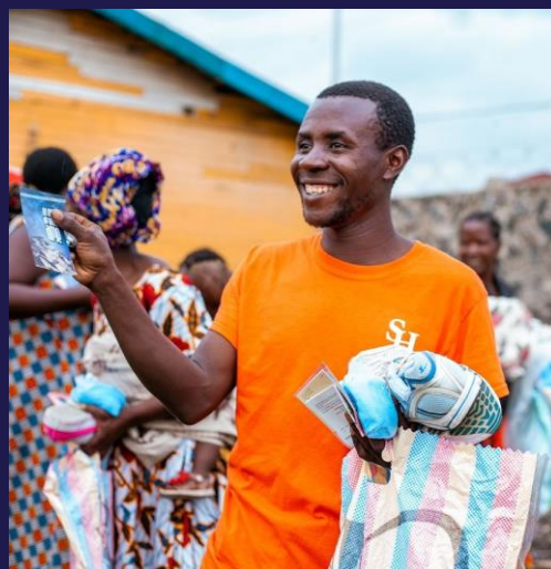
Testifying of God's Love in DRC!