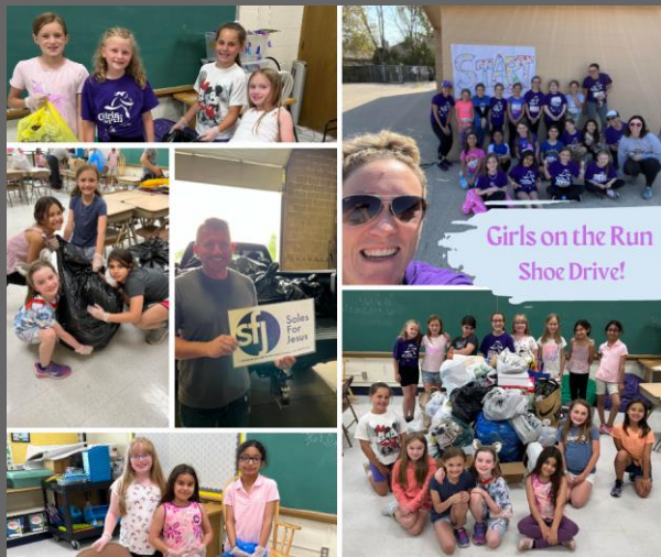
"Girls on the Run" collecting shoes!

we're thrilled for the many kids and adults in Africa who will receive these great shoes.