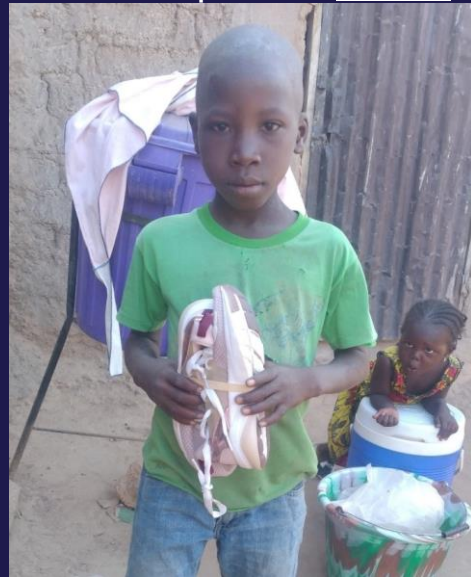
Finding new life in Jesus!