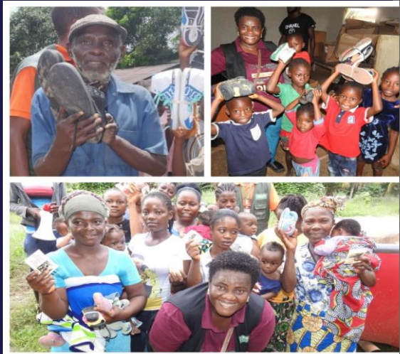
Salvations and joy in Liberia