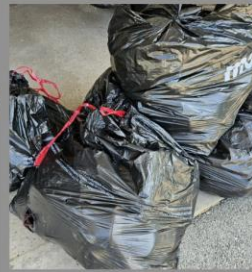
Shoes from Sussex Outreach Center!