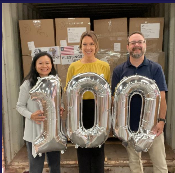
With love & prayers for Liberia!