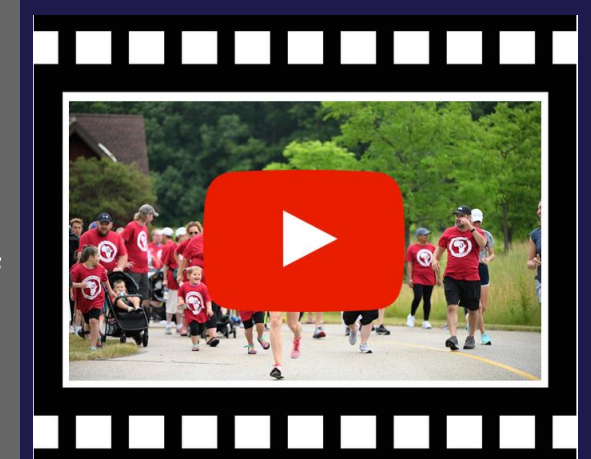
Click to watch 2022 Highlight Video!