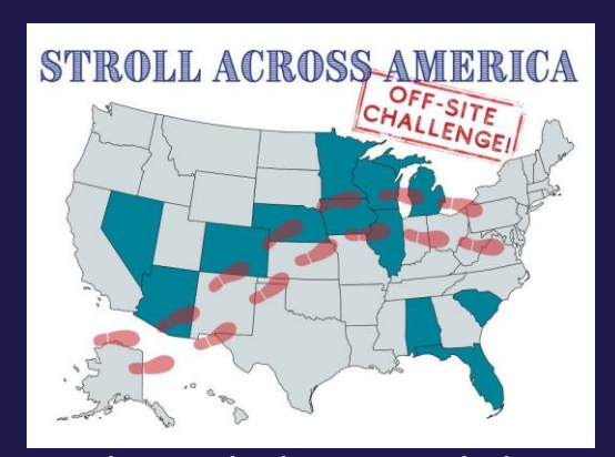
Please help spread the word!