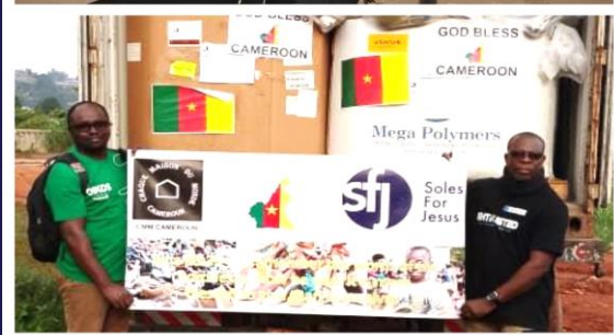
Blessings to Mozambique and Cameroon!