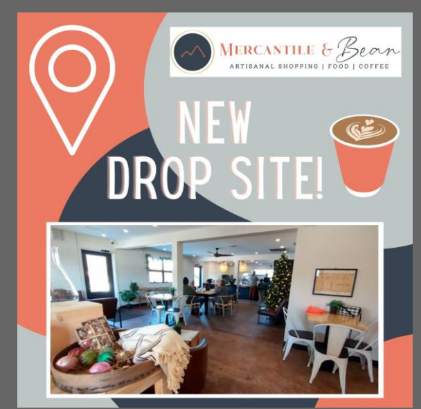
New Shoe Collection Site in Genesee.

Tonawanda Service Club, WI-We enjoyed having this great group of volunteers serve in our warehouse and they also collected 500 pairs of shoes from their community. Their kindness is changing lives locally and in Africa!