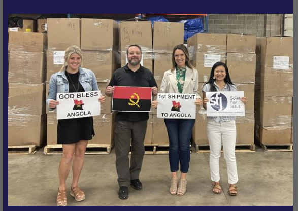
With love & prayers to Angola !