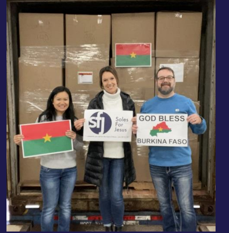
With love & prayers to Burkina Faso !