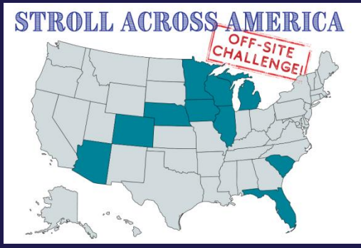
Please join us from your state!

us light up your state by registering today! Be sure to choose our discounted Off-Site Registration (just to cover shirts & shipping).