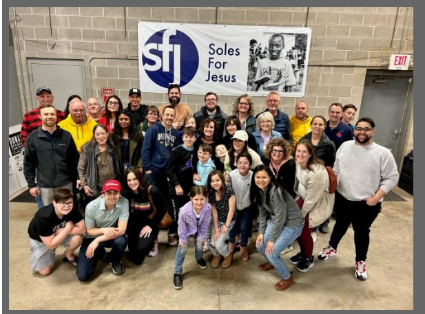
Thank you, Shorepoint Church!

Saturday, June 3rd, 9-11am Saturday, June 10th, 9-11am Monday, June 12th, 1:30-3:30pm Tuesday, June 13th, 6-8pm Wednesday, June 14th, 9-11am Saturday, June 17th, 9-11am Wednesday, June 21st, 1:30-3:30pm