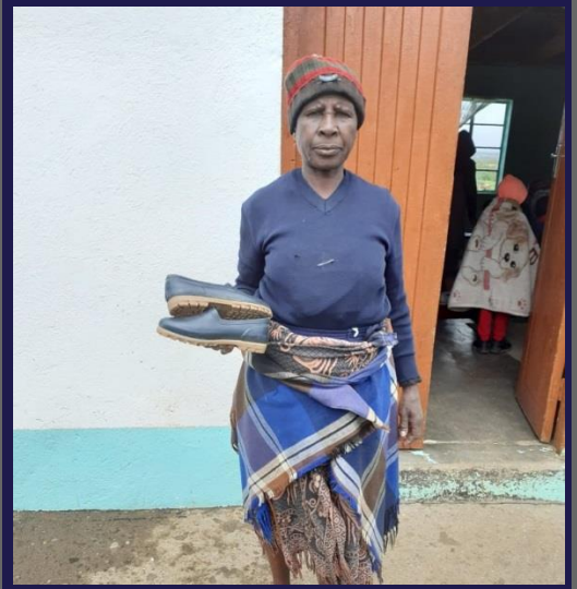
God answered her prayer just in time!