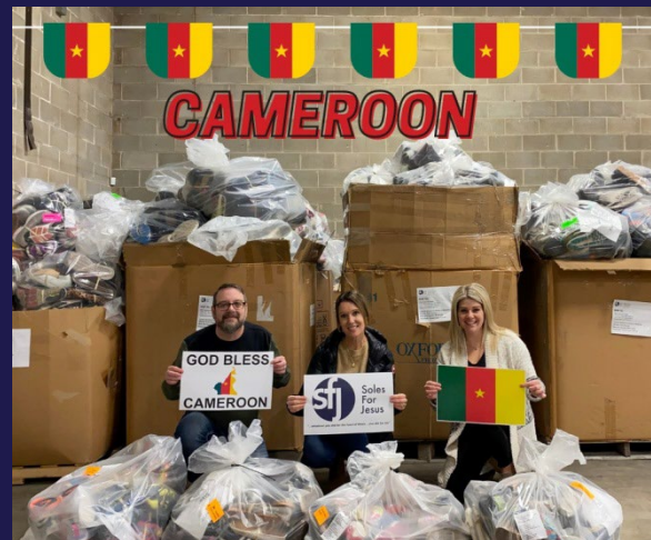
Sent with love & prayers to Cameroon!