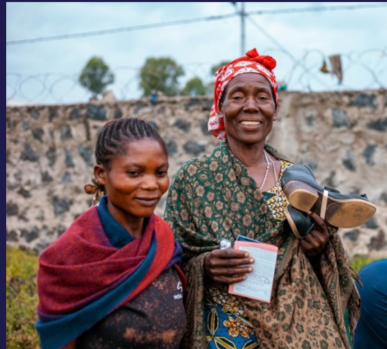
Sharing Jesus at a refugee camp.