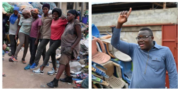
Sharing God's love & shoes in Togo!