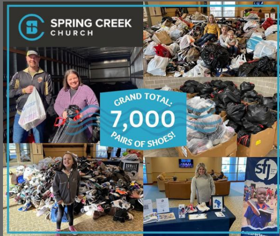
Amazing new record from SCC!