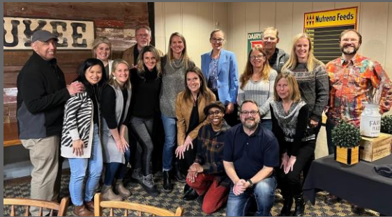
We love our SOS Leaders!

Last week, we had the privilege of honoring and celebrating this special group at an appreciation dinner. We pray God's blessing over each of the families represented here and those who were unable to join us. Thank you for serving the Lord and others so faithfully!