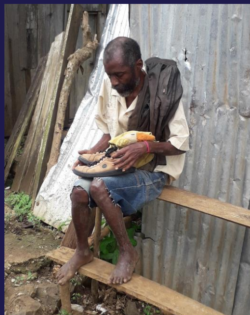
Sharing God's love door to