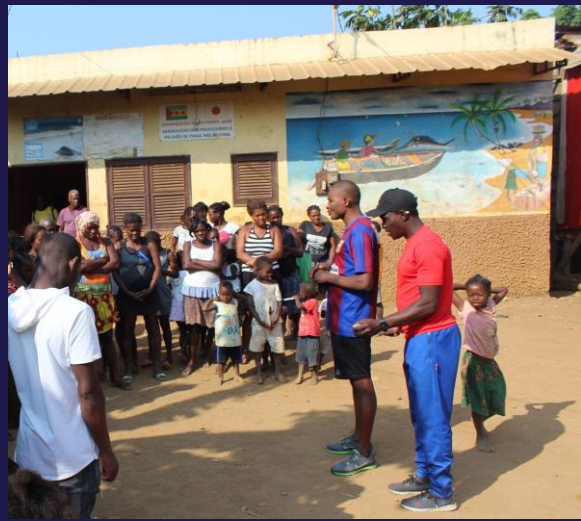
128 people said YES to Jesus on this day!