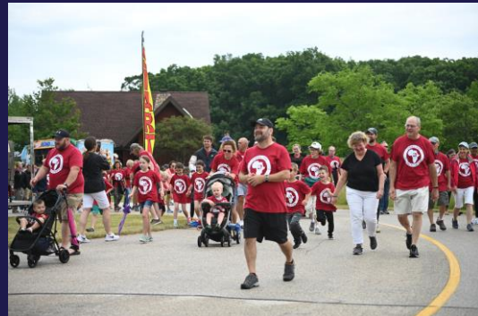
2022 Stroll For Soles VIDEO

CLICK image below to VIEW our Highlight Video: