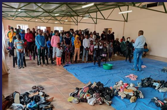
God is moving in Mozambique!