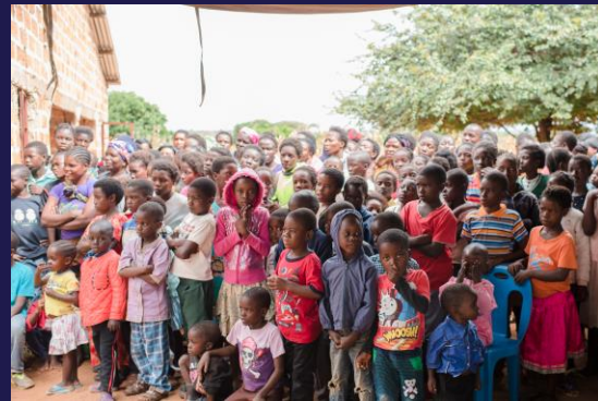
Hearing about Jesus in Burkina Faso