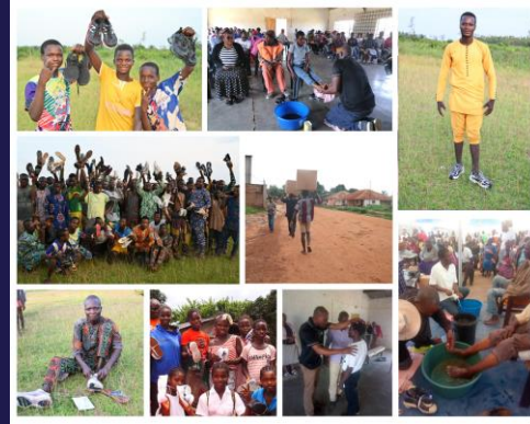
Some of our favorite photos from 2022!

LORD never ceases; His mercies never come to an end; they are new every morning; great is your faithfulness." Lamentations 3:22-23