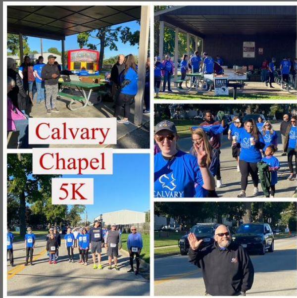
5K event at Calvary in Racine.

We are so blessed by everyone at Calvary Chapel who participated in a 5K event to raise funds and help spread the mission of Soles For Jesus! Thank you to each person who organized, attended and supported this fantastic event that will impact many lives in Africa!