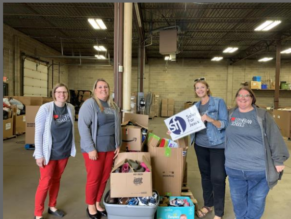
Teachers from Trinity Lutheran