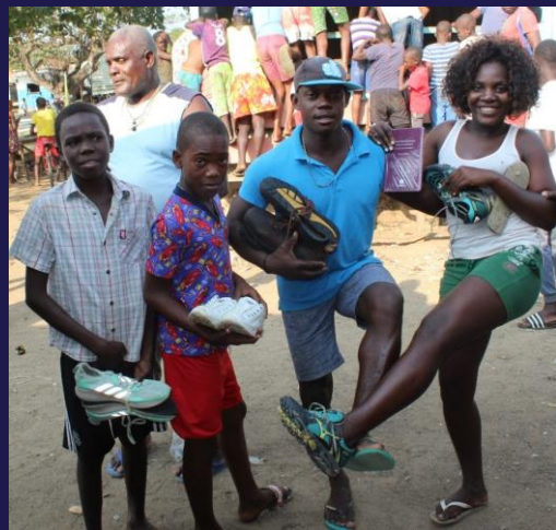
God bless the people of São Tomé!