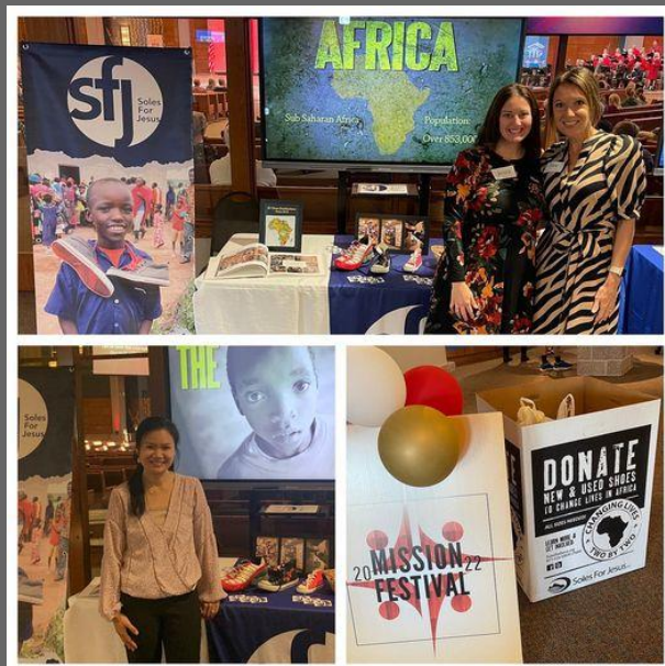
HCL Mission Festival