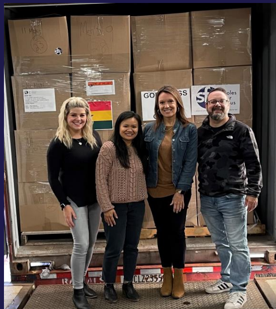
May God Bless Ghana!