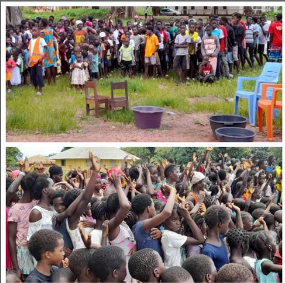
Saying "Yes" to Jesus in Guinea-Bissau!