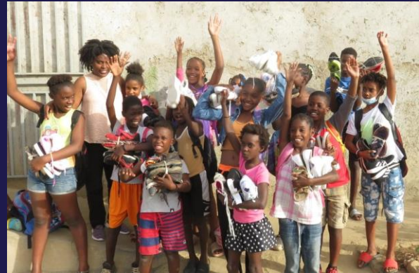
God is moving in Republic of the Congo!