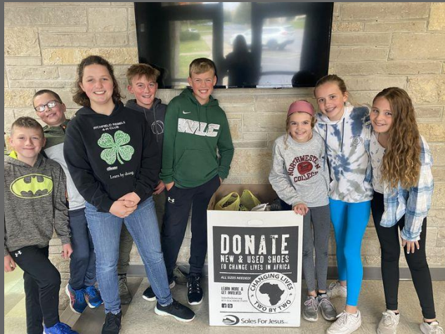
Students from St. John's Lannon.