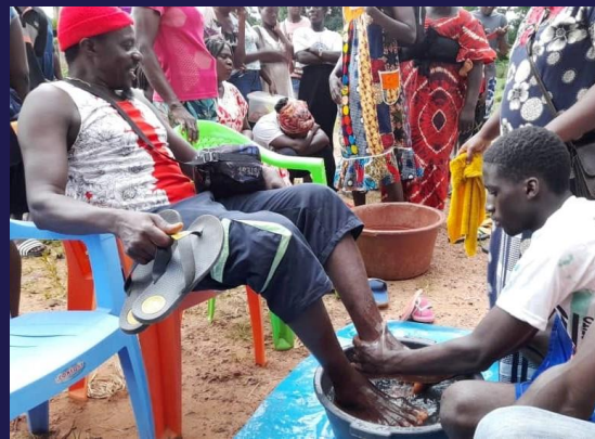
God's love changes lives!