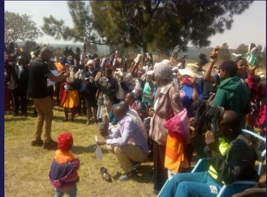
God is moving in Eswatini!