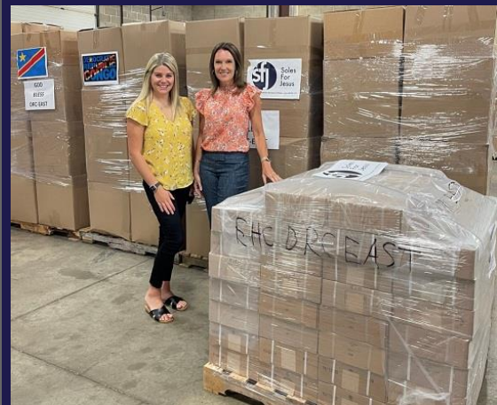
Shoes & Gospel booklets in route to DRC!