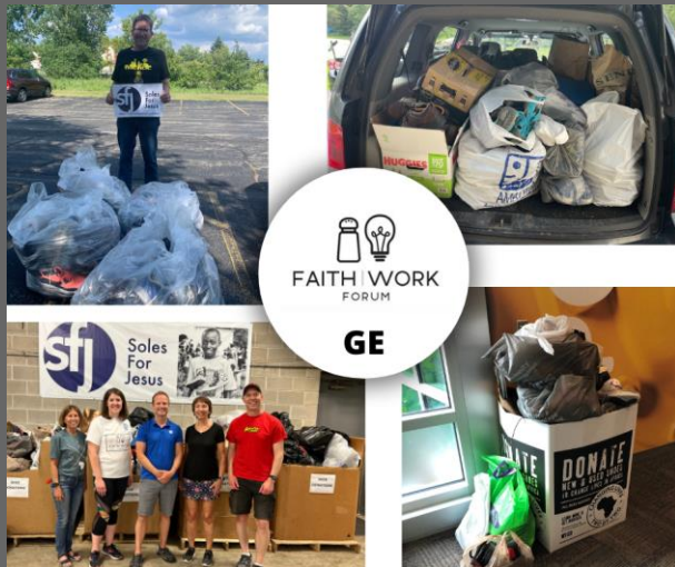
GE Faith Forum Shoe Drive