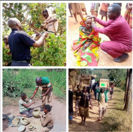
Sharing Jesus in Burundi!