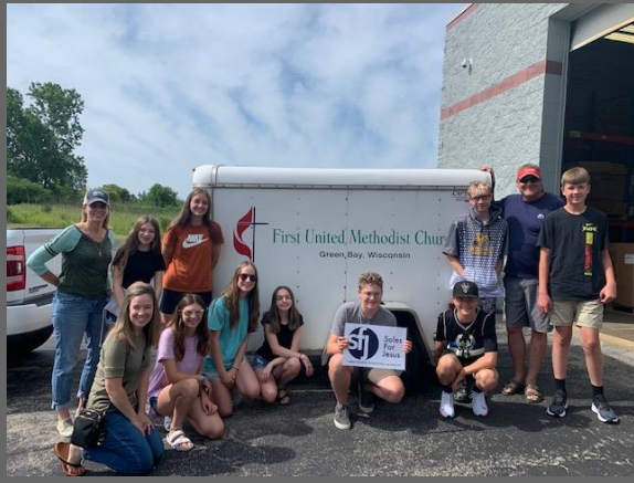
FUMC- Green Bay Youth Group