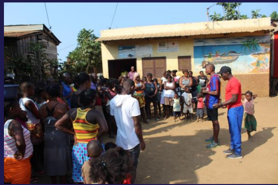
God is moving in São Tomé & Príncipe!

We love these beautiful kids shoes from Once Upon A Child in Brookfield. We know that many children in Africa will be jumping for joy when they receive these gifts of hope! As your student(s) head back to school, consider donating the shoes you no longer need. Kids in Africa will be so grateful and we thank you!