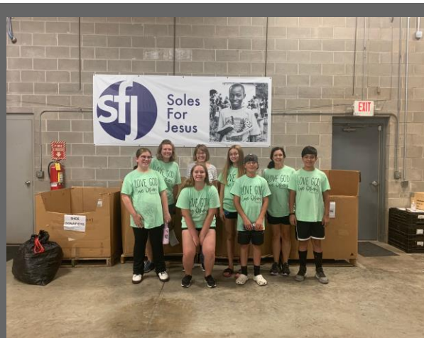
Thank you Blessed Savior Youth Group!