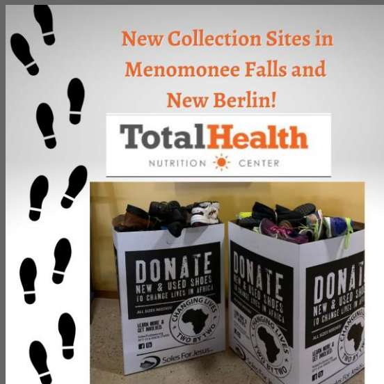
New Collection Site at Total Health!