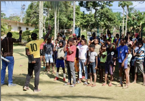
Saying "YES" to Jesus in São Tomé & Príncipe

P.S. This is a great time to clean out your closets with the shoes you no longer need, and we'll gladly send them to Africa!