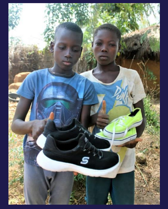
God is meeting needs in surprising ways.

and he wanted to bless them each with a pair of shoes as a demonstration of God's love and care for them. How wonderful it is to hear stories of people willing to look out for their neighbors so they can share the love of God with others. Please pray for many more in this village to come to salvation in the name of Jesus Christ. View more photos <u>HERE.</u>