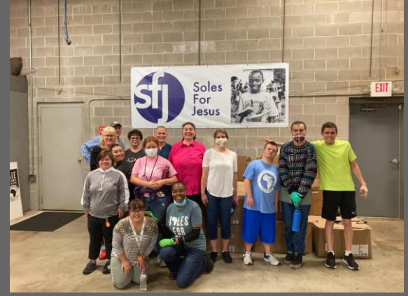
Thank you for serving, Shepherds College!

Friday, December 3rd, 6-8pm FULL Saturday, December 4th, 9-11am Thursday, December 9th, 9-11am Saturday, December 11th, 9-11am Thursday, December 16th, 6-8pm Saturday, December 18th, 9-11am