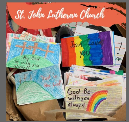
Sweet cards from the kids at St. John's!