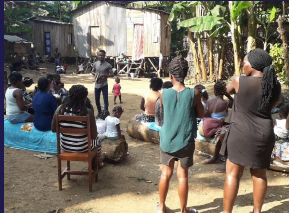
Sharing the Gospel in a rural village.