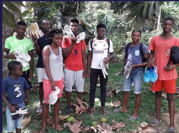
Lives are being transformed in Congo.