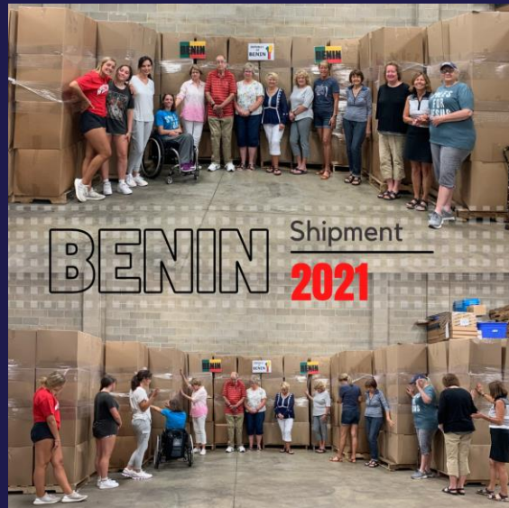
Volunteers praying for the nation of Benin.