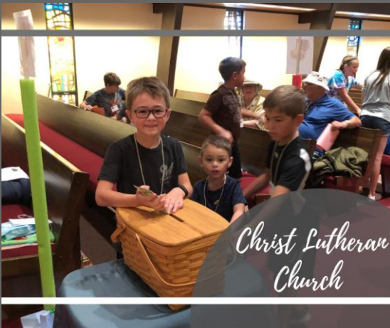
Kids donating funds for SFJ.

Christ Lutheran Church, Marshfield - We love seeing children demonstrate great faith to invest into God's Kingdom! During their VBS week, everyone had an opportunity to donate shoes and/or funds. Every pair of shoes and dollar will go a long way to bless so many in Africa with the message of Jesus!