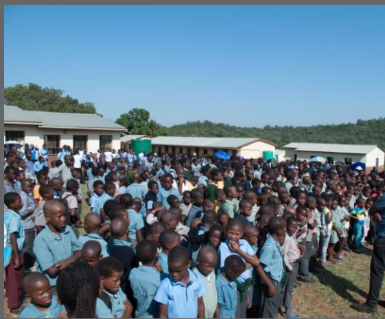
School in Loyiwe Village,