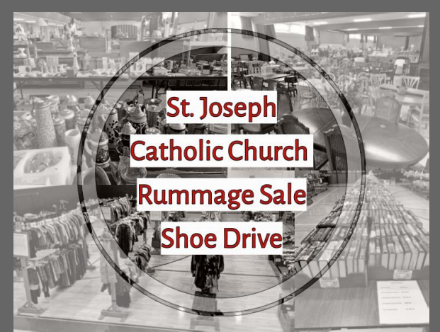
St. Joseph Catholic Church Shoe Drive

St. Joseph Catholic Church Rummage- We want to thank all of the families of St. Joseph for including SFJ in their annual rummage sale. By donating all of the shoes that were not sold, you are touching many lives in Africa!