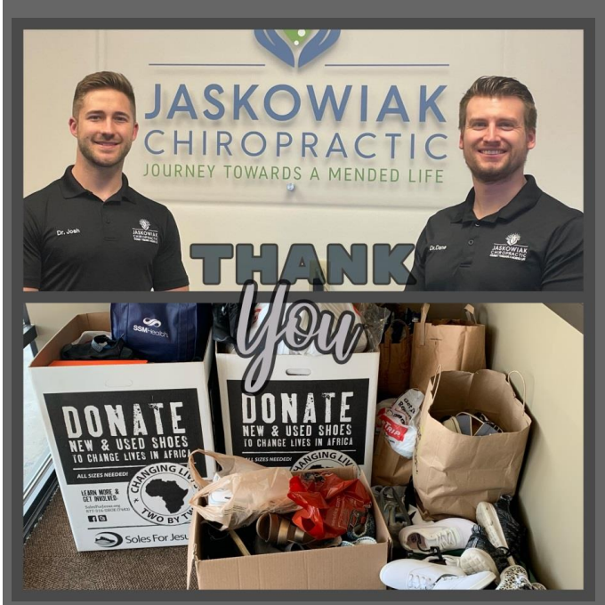
Jaskowiak Chiropractic Shoe Drive