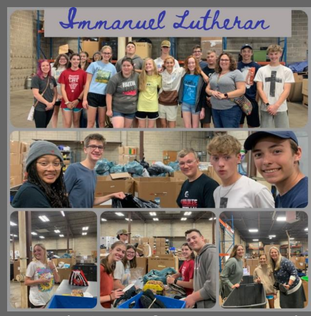
Youth Group from Immanuel Lutheran Church

Saturday, September 4th, 9-11am Tuesday, September 7th, 6-8pm Saturday, September 11th, 9-11am Saturday, September 18th, 9-11am Wednesday, September 22nd 9-11am Saturday, September 25th, 9-11am