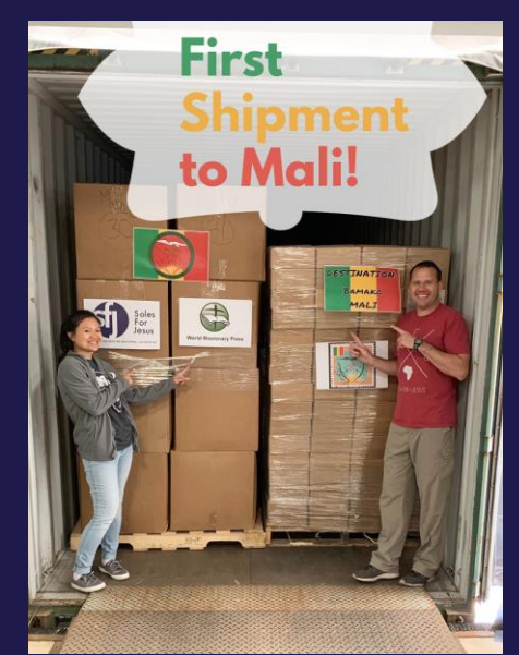
Shoes & Gospel booklets in route to Mali!