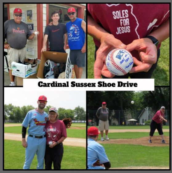
Cardinal Sussex game & shoe drive!

St. Joseph Catholic Church Rummage- We want to thank all of the families of St. Joseph for including SFJ in their annual rummage sale. By donating all of the shoes that were not sold, you are touching many lives in Africa!