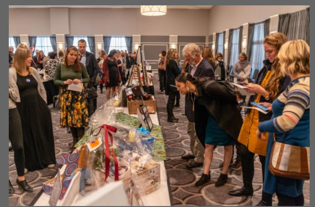
Guests enjoying the silent auction