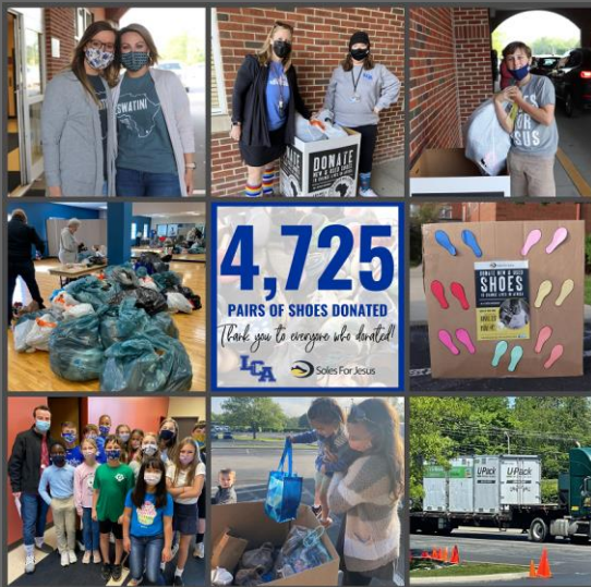
Shoe Drive at IBC & LCA in Kentucky!

thrilled that over 5,000 pairs of shoes were collected! The impact this will have on thousands of lives in Africa is overwhelming, as each person will hear about Jesus. Thank you for your compassion to love others so well!