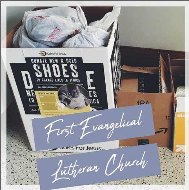
Shoe Drive at FELC in Racine!