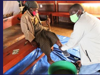
Reaching Eswatini one person at a time.

harvest in this nation. View photos HERE .