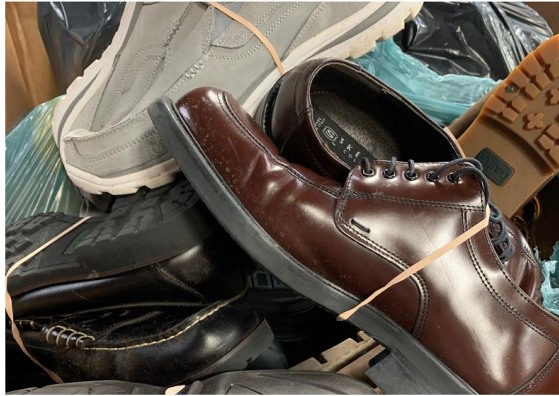
Great shoes from Health In Balance.

St. Paul Lutheran, Stevens Point - These fantastic students collected 333 pairs of shoes and the funds to help send them to Africa during their VBS week. They also made a special trip to deliver and pack their shoes in our warehouse! We are grateful for all that they've done and for including SFJ in their summer plans. God bless you all!