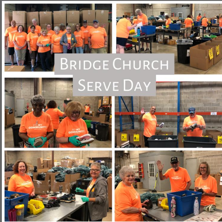
Bridge Church on their, "Serve Day"!