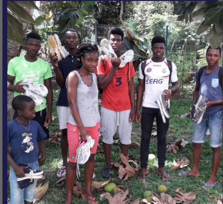
Celebrating new shoes with friends.