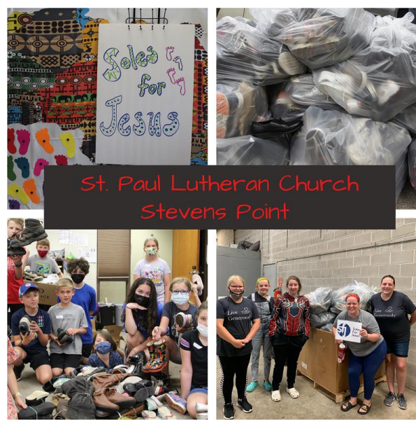
Youth Group from St. Paul Lutheran.

St. Paul Lutheran, Stevens Point - These fantastic students collected 333 pairs of shoes and the funds to help send them to Africa during their VBS week. They also made a special trip to deliver and pack their shoes in our warehouse! We are grateful for all that they've done and for including SFJ in their summer plans. God bless you all!