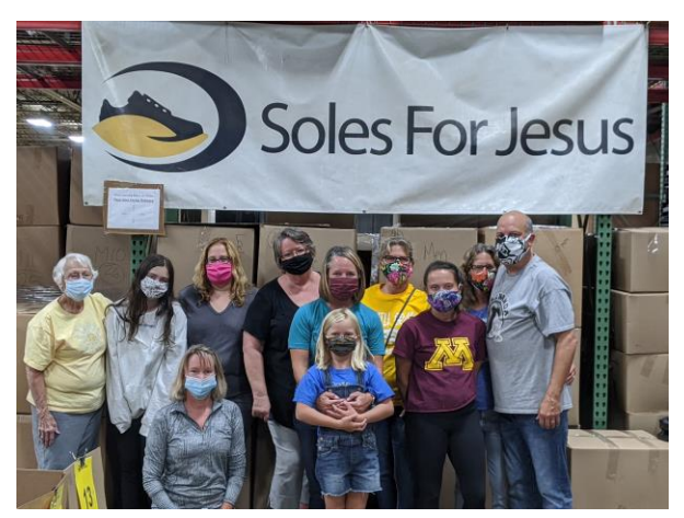
hank you, North Shore Congregational Church!

"Business Hours" SOS: Volunteers can also durina come weekdays to pack shoes (Mon-Fri, 9am-4pm). Come and sort shoes when it fits your schedule. You can sort for an hour or a day; it's entirely up to you and please feel free to friends! Training will be provided and SFJ staff will always be available to provide support. For more details, please Mark contact at Mellefson@SolesForJesus.org or (414)3 65-1392.