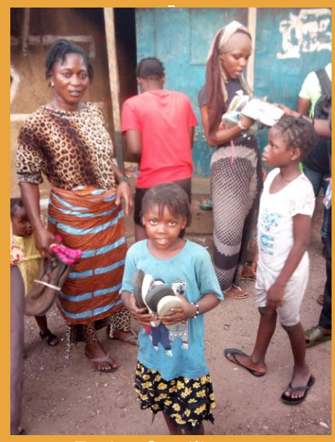
Entire families are responding to Jesus in Guinea.

overwhelmed by the needs of people in his nation. With the challenges of COVID-19 beginning to show, he shares that a gift of shoes is a blessing. Most tremendous importantly, he testified that people's hearts are responding to the message of salvation more than ever. This is the core mission of SFJ and we ask that you pray for the ongoing ministry taking place, even as you read this newsletter. We are eager to help get the Good News everyone. View more pictures HERE.