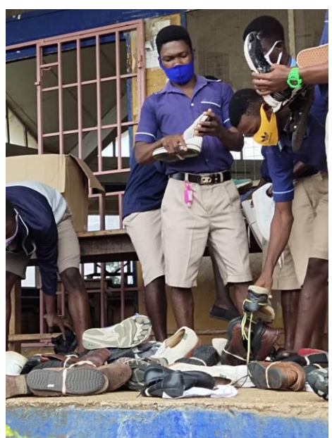
Shoes provide opportunity at the School for the Blind.

11th Annual Luncheon & Auction! November 14th, 2020