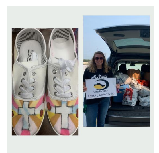
Shoes from Blessed Savior with beautiful artwork!

School- Thank you HCLC for another fantastic shoe drive and for bringing a group to volunteer and donating funds to help send the shoes to Africa! You truly know how to love and serve like Jesus and we're so grateful for your partnership!