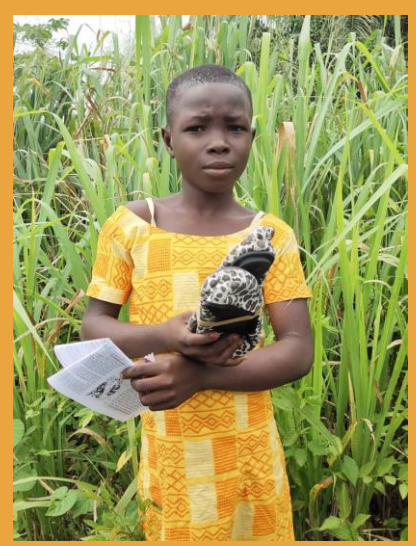
Receiving the Gospel & shoes is life-changing!

Now that smaller gatherings are being permitted, the team is ministering to people by meeting their physical and spiritual needs. They ask for prayer as they are traveling to places in great need of hearing the truth from God's Word. Please pray for lives to be impacted for eternity throughout this West African nation. View more pictures HERE.