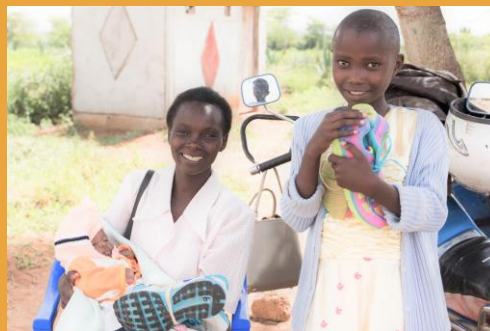
Experiencing God's love in Lesotho!