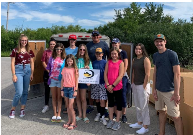
FUMC delivering their shoes from