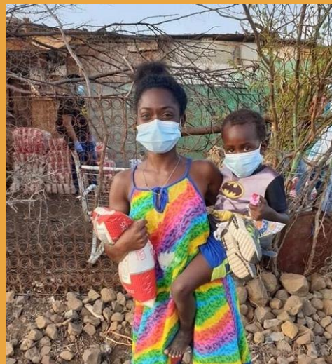
Mother and child grateful for rice and shoes.