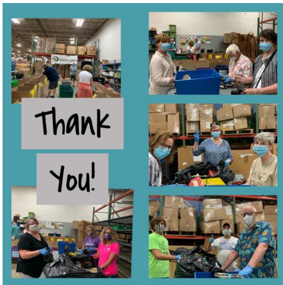
North Shore Congregational Church serving.

North Shore Congregational Church, Fox Point - What a great group from North Shore Congregational Church. They arrived with a trunk full of shoes, and hearts ready to serve! This group worked with such joy and excellence. Thank you for your time and support!