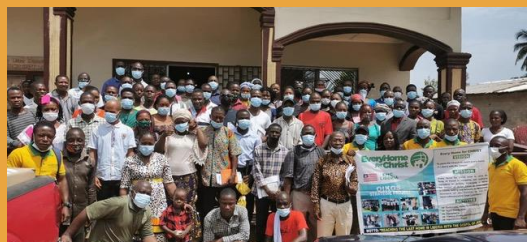
Ministry volunteers ready to share the Gospel.

"Now we will also be able to minister with shoes, thanks to the shipment from Soles For Jesus! These are wonderful tools for sharing the Christian faith as well as health and safety guidelines. We thank God for these gifts at the perfect time!"