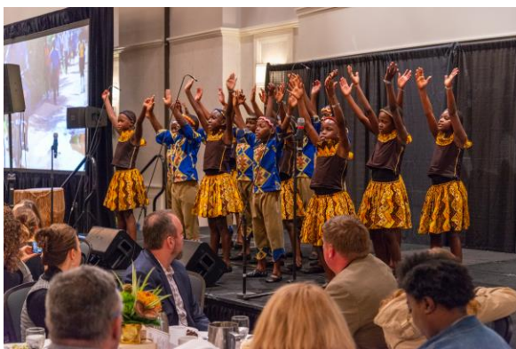
10 Year Celebration & The African Children's Choir.