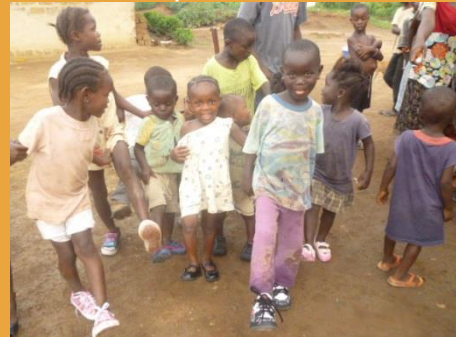
The children showing off their new shoes.