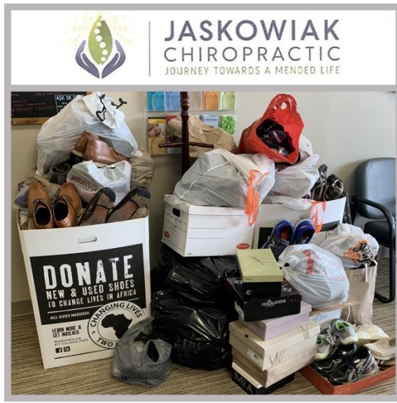
Shoes piling up at Jaskowiak Chiropractic.