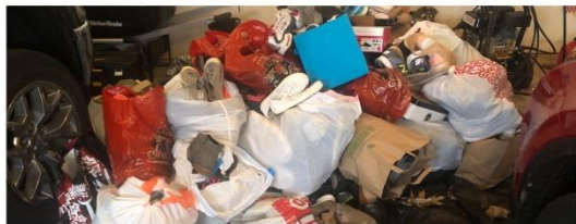
Gina's family collecting shoes at their home!