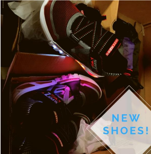
Boxes of new "light-up" shoes from Oregon!