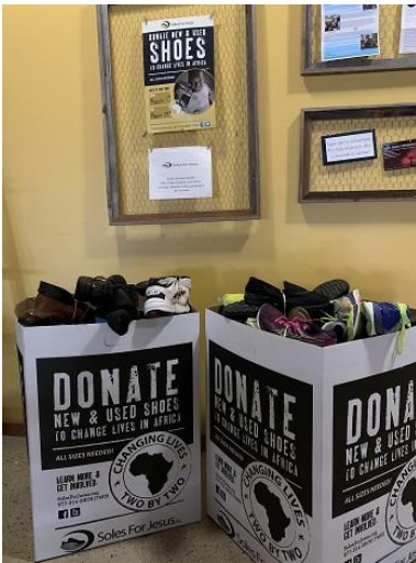
Collection boxes overflowing at Portview A/G!

coordinating this shoe drive at Portview Assembly of God, and to everyone who donated shoes. These gifts of hope will bring encouragement and life to many who need them, along with the message of Christ. Thank you for partnering with us for the harvest!