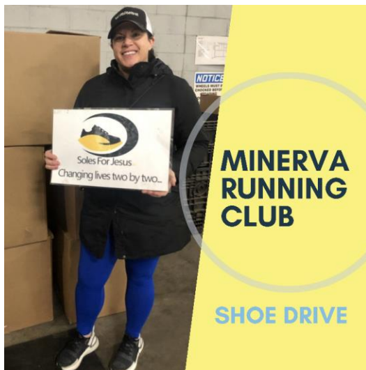
Delivery of shoes from Minerva Running Club!