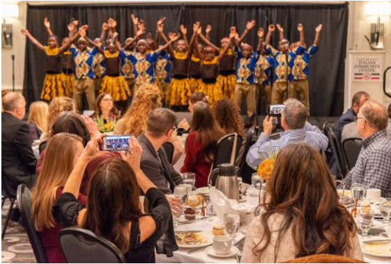
SFJ 10 Year Celebration & Luncheon