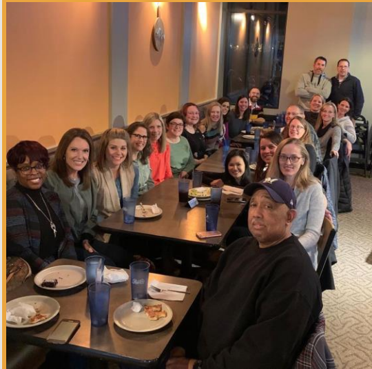
Thank you SOS leaders! (Not all pictured)