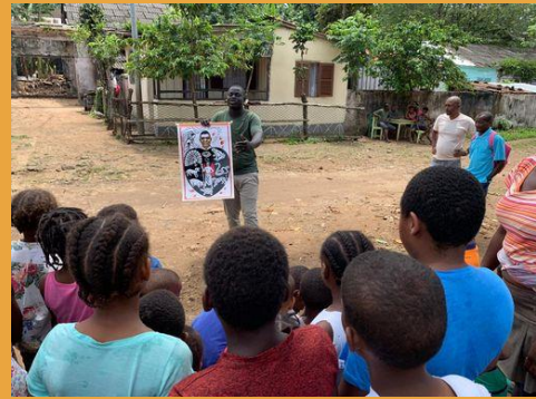
Sharing the Gospel with the next generation.