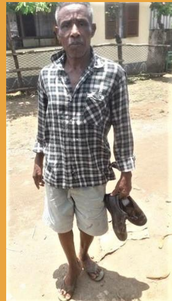
Touched by God's love.

Minerva Running Club, WI - Thank you, Minerva Running Club, for doing a shoe drive for us. With these great running shoes we can provide quality footwear to protect feet and help people walk safely on rocky, dirt paths. Your support is changing lives in Africa!