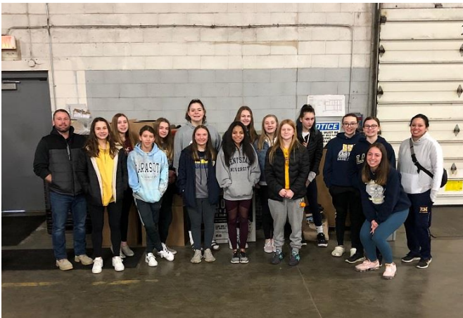
Kettle Moraine High School Girls Basketball Team

Kettle Moraine Girls Basketball - A very BIG thanks to this team for hosting a large shoe drive at their school and for coming to volunteer with us this month. Over 1,100 shoes were packed because of your time and service. The shoes and funds that you collected will impact lives and we appreciate your kindness and teamwork!