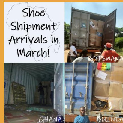
Praise God for His protection over 3 shipments!