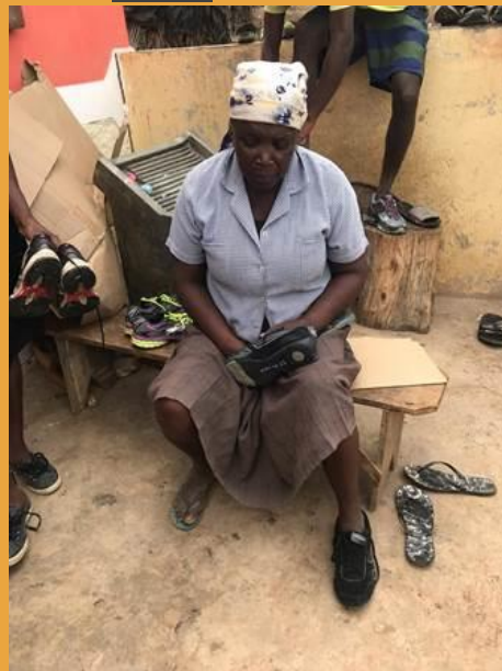
A woman in Achada Grande receiving new shoes.

View more pictures from Cabo Verde HERE .