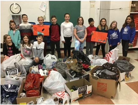
The Student Council at Bethesda Elementary School.

NextGenCAM, WI - We are grateful for businesses who partner with us to impact our world. Thank you, NextGenCAM and Comprehensive Counseling, for donating such great shoes for our next shipment!