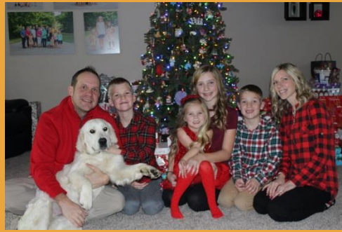
The Winkelmann Family!