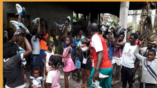
Young people celebrating Jesus and their new shoes.