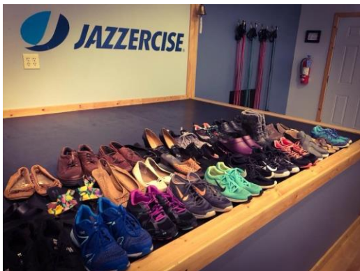
Shoe drives at Jazzercise in Brookfield and Kewaskum.

Jazzercise in Brookfield and Kewaskum - We appreciate businesses who partner with us! Many thanks to Jazzercise in Brookfield and Kewaskum for doing a shoe drive this month. We are touched by your compassion and many people in Africa will be greatly blessed by your gifts.