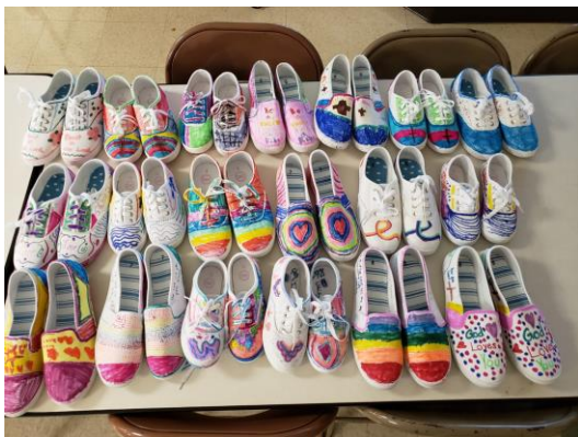
Beautiful shoes decorated and donated by Girl Scouts!