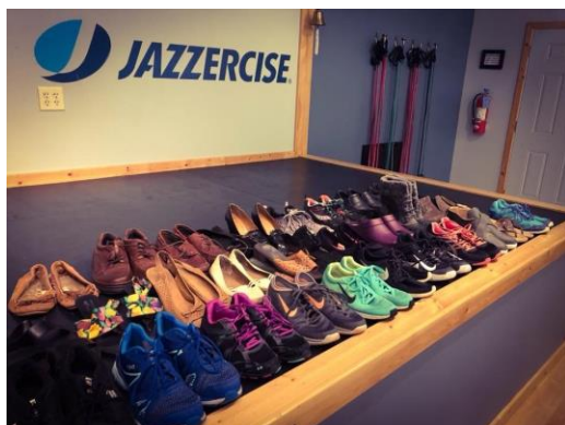
Shoe drives at Jazzercise in Brookfield and Kewaskum.

Jazzercise in Brookfield and Kewaskum - We appreciate businesses who partner with us! Many thanks to Jazzercise in Brookfield and Kewaskum for doing a shoe drive this month. We are touched by your compassion and many people in Africa will be greatly blessed by your gifts.