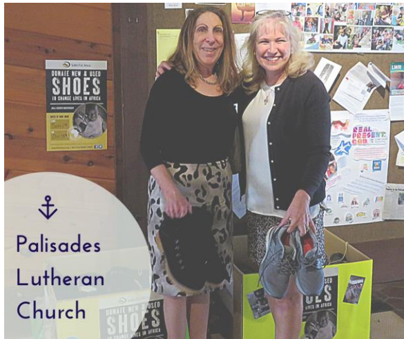
Shoe drive at Palisades Lutheran Church in California.