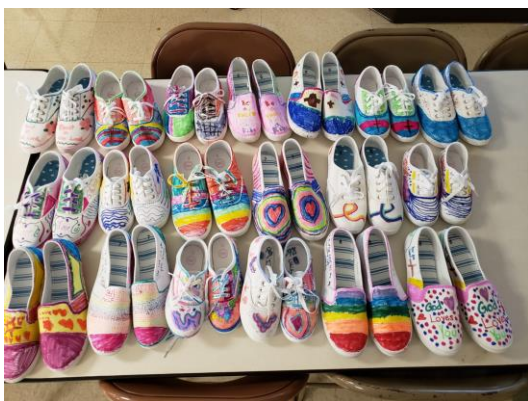
Beautiful shoes decorated and donated by Girl Scouts!