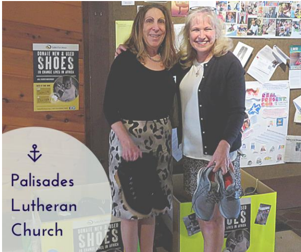
Shoe drive at Palisades Lutheran Church in California.