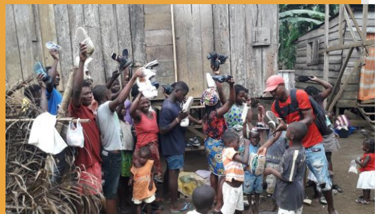
People in Gil André after receiving shoes and the Gospel.

View more pictures of the Cabo Verde shipment HERE .