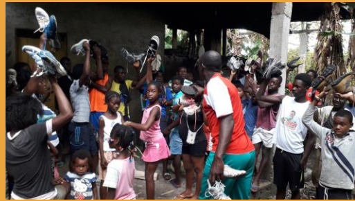
Young people celebrating Jesus and their new shoes.