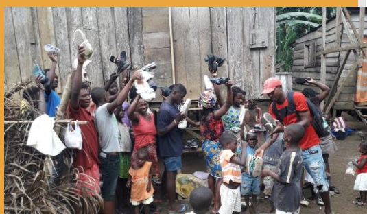
People in Gil André after receiving shoes and the Gospel.

View more pictures of the Cabo Verde shipment HERE .