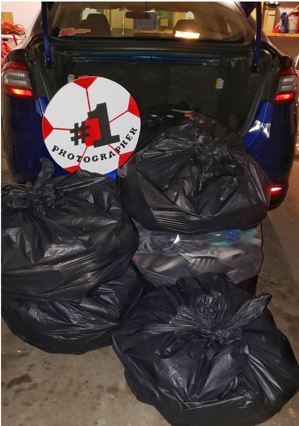
Shoes from the Sussex Hamilton Boys Soccer Team.