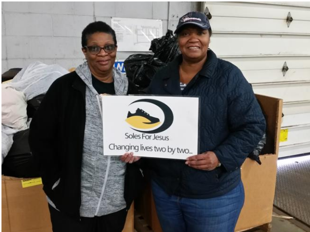
Thank you, Northside Church Of God, for your great shoes!

Northside Church Of God, WI- We are so thankful to everyone at Northside Church Of God for donating over 386 pairs of shoes and the funds to help send them to Africa! What a blessing to have your support as we share the gift of shoes with God's love to so many. Special thanks to Hope for coordinating this effort and delivering these shoes!