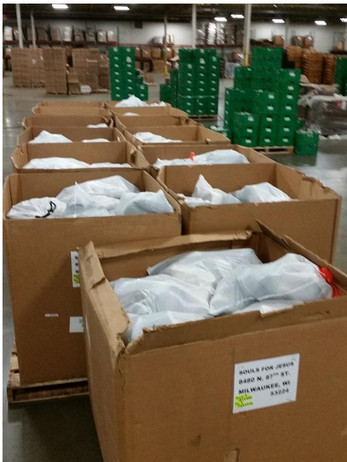
Delivery of shoes from PA in our warehouse.