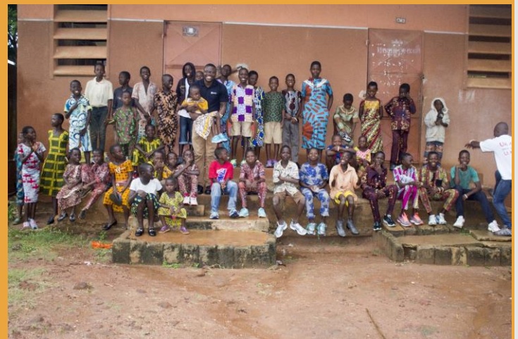
Many gathered for a photo to celebrate what the Lord has done!