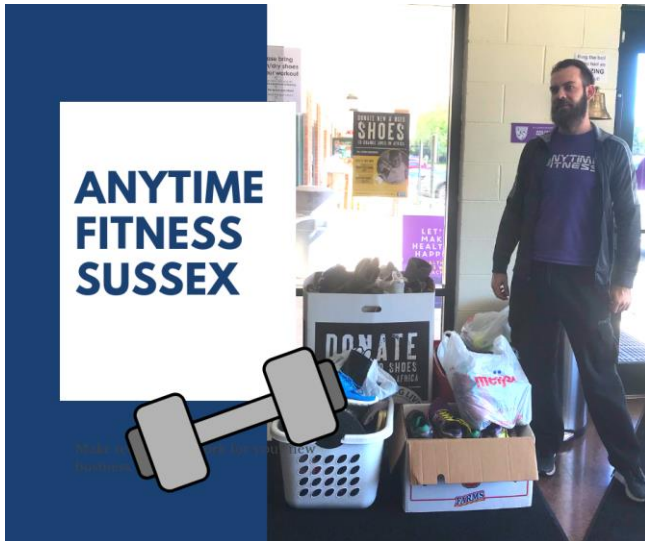
Shoe drive at Anytime Fitness in Sussex.

that your collection box is overflowing and that you've had such a great response with your first shoe drive! Thank you for making a global impact across the world from your gym.