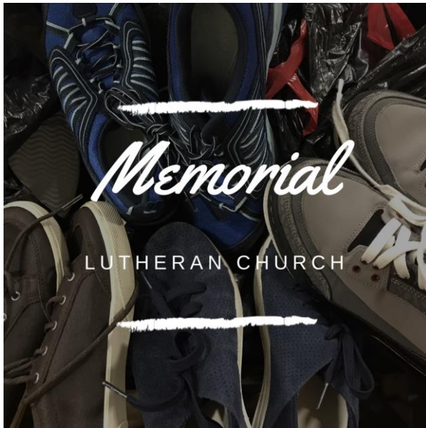
Many beautiful shoes from Memorial Lutheran Church.

lives in a big way, and we also appreciate the funds to help ship them to Africa!