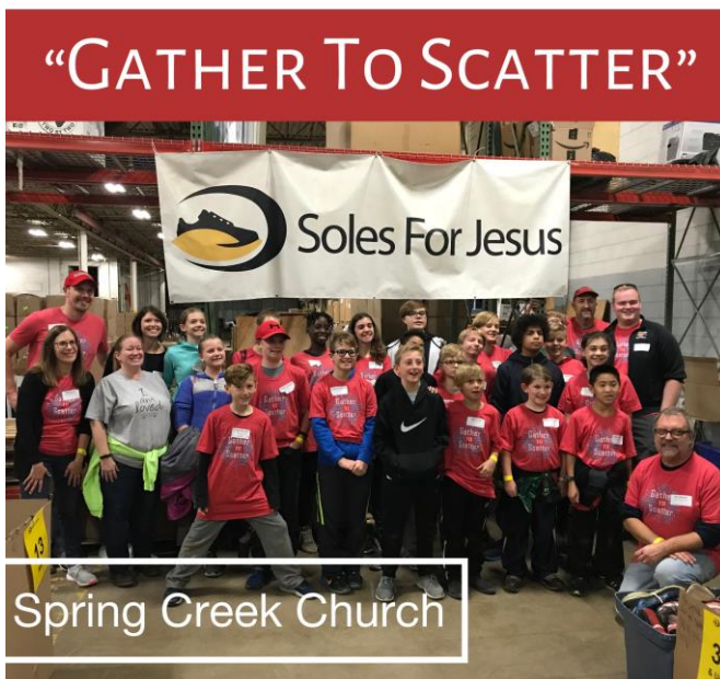
We enjoyed hosting the "Gather To Scatter"

SOS Events (Sort & Organize Shoes) Join us as we gather at our Milwaukee, WI warehouse to prepare shoes for shipment to Africa! New volunteers are always welcome and we will have a brief orientation before each event. Please contact us at 414-365-1392 or Yenh@SolesForJesus.org to sign-up for a date and time to come and volunteer.