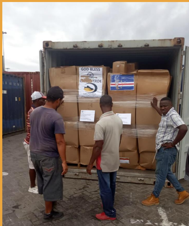
Opening the container for the first time in Cabo Verde.