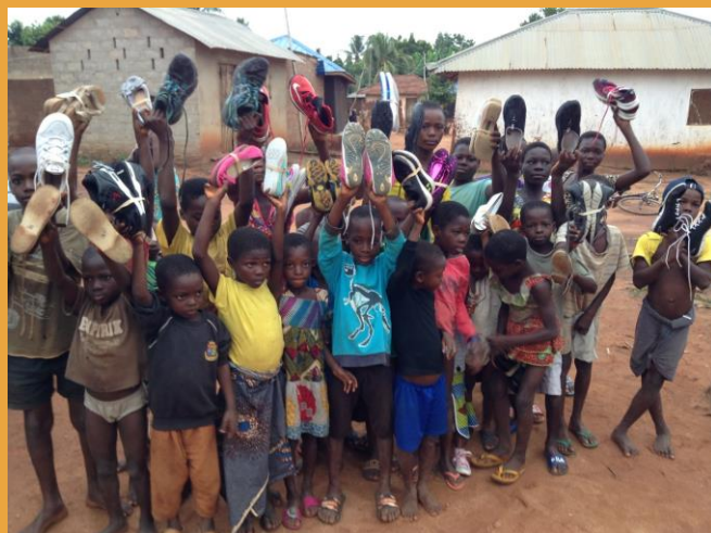
Very grateful children in Benin.