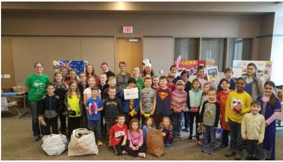
FISH Homeschool group with their shoes.

Northbrook Church, Richfield - These ladies know how to give and serve in unlimited ways! We're so grateful for the Moms Group at Northbrook Church and the many shoes they collected from their family and friends. Thank you, friends!