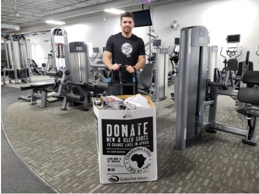
Anytime Fitness in Waukesha helps collect shoes for Africa!

people gain access to quality footwear to protect their feet.