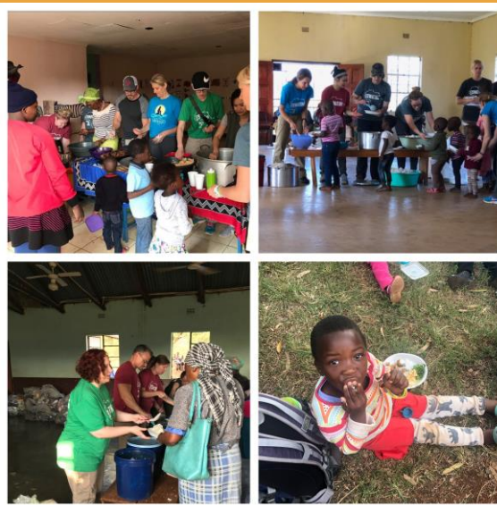
Serving meals in the villages and orphanage.

The event will start and end at the beautiful campus of Waukesha County Technical College and we'll enjoy a scenic route through the streets of Pewaukee. You can choose to walk, run or cheer on those who do! The morning will also include medals, prizes, refreshments and exciting games. There will be a special visit from Roscoe, the Milwaukee Admirals mascot, so you can