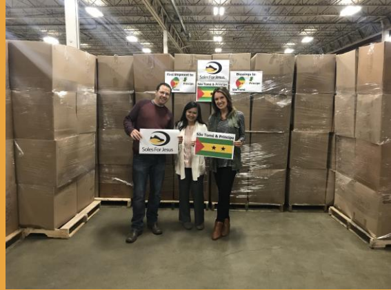
Our first shipment to Sao Tome & Principe!

and that many will place their faith in Jesus Christ.