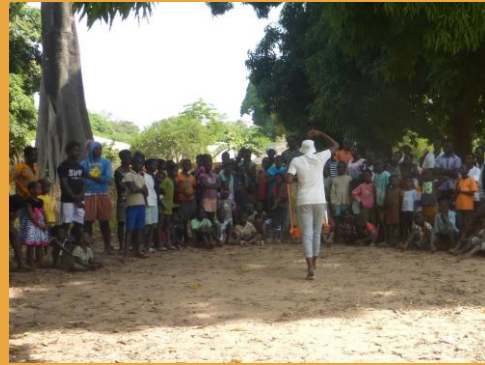
Crowds of people listening to the Gospel message!

every Saturday for a Bible study and four of them have been baptized this week. Glory to the name of the Lord!" View more pictures HERE .