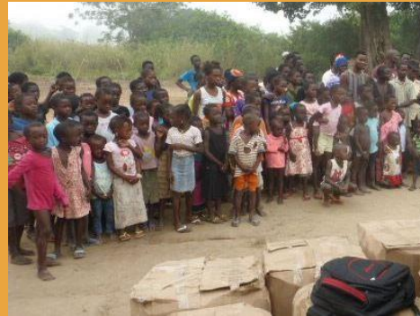
People in Ondeme awaiting the start of the shoe distribution.

reach the people of our nation, spiritually as well as physically." View more pictures HERE .