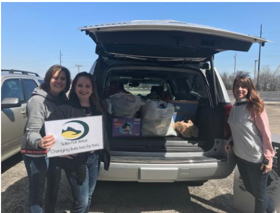
Northbrook Moms Group delivering shoes.

Northbrook Church, Richfield - These ladies know how to give and serve in unlimited ways! We're so grateful for the Moms Group at Northbrook Church and the many shoes they collected from their family and friends. Thank you, friends!