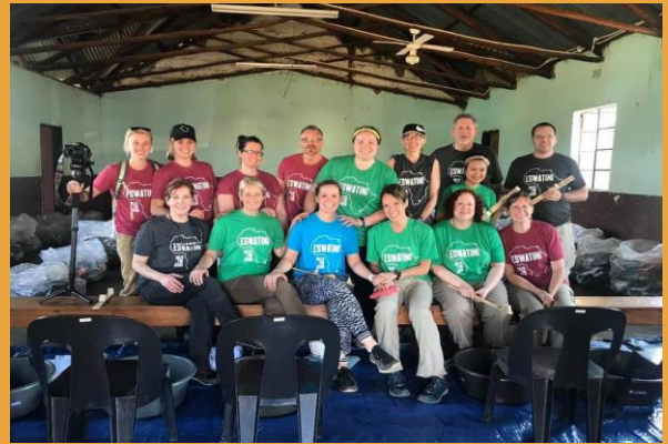
Team eSwatini sharing the love of Jesus with foot washing.