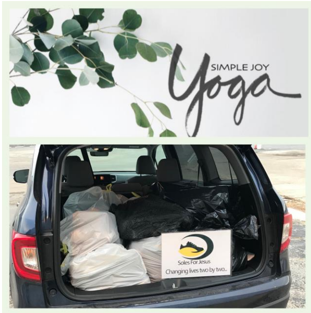
A generous delivery of shoes from Simple Joy Yoga Studio.