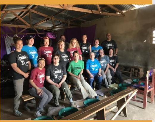
Team Zambia in 2018.

Our team is almost full but we have room for 1-2 more if you reach out soon before we purchase flights next month. Contact Yenh as soon as possible for more information at 414-365-1392 or at <u>Yenh@SolesForJesus.org</u>. To view a photo album from our last <u>mission trip</u> to Zambia, click <u>HERE</u>.