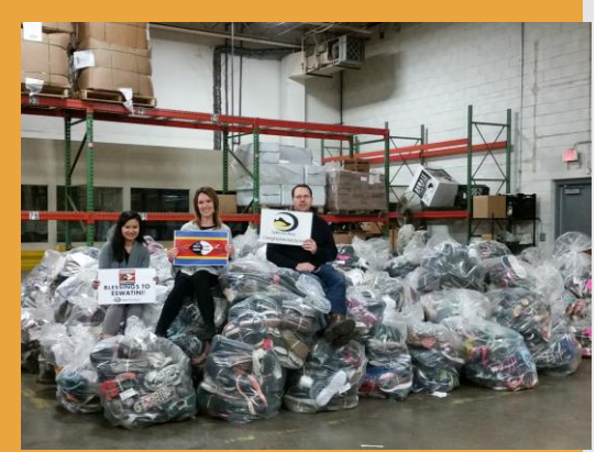
We can't wait to distribute these shoes with our mission team!

the team arrives in early May. Please be praying for the people who will receive these shoes. It is our passion for each person to hear the Gospel and place their faith in Jesus Christ, who is the giver of every good and perfect gift. Please also pray for a safe journey and smooth customs clearance for these shoes. View more pictures <u>HERE</u>.