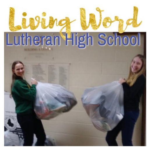
Students collecting shoes at Living Word Lutheran High School.

world. The shoes collected will be a blessing to many and we thank you for your servant hearts to give so generously!