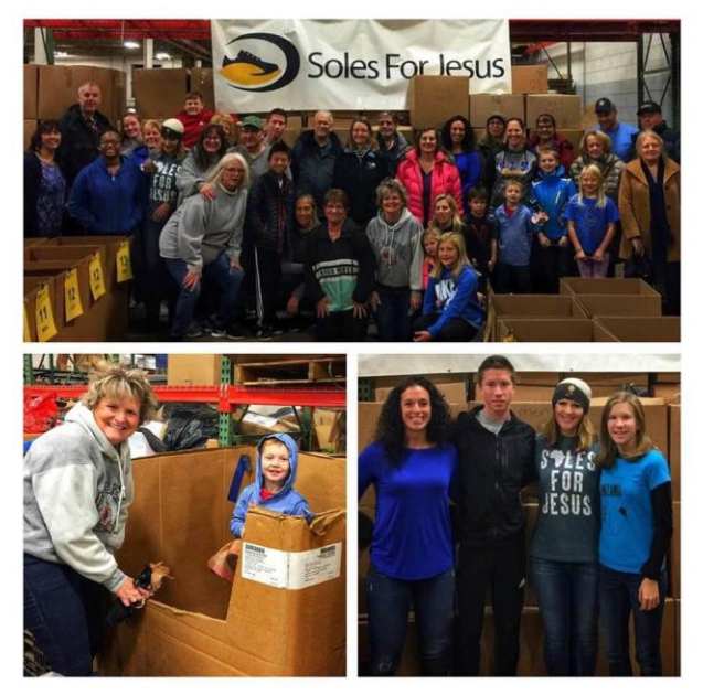
Thank you Spring Creek Church volunteers!

SOS Events (Sort & Organize Shoes) Join us as we gather at our Milwaukee, WI warehouse to prepare shoes for shipment to Africa! New volunteers are always welcome and we will have a brief orientation before each event. Please contact us at 414-365-1392 or <u>Yenh@SolesForJesus.org</u> to sign-up for a date and time to come and volunteer.