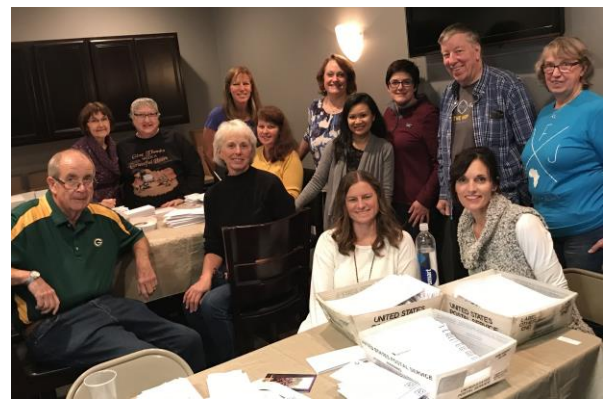
November mailing crew!

November Mailing Volunteers - We are so thankful for volunteers who help us throughout the year with important mailing projects. They are an incredible blessing and we appreciate each of them for their faithfulness in serving!