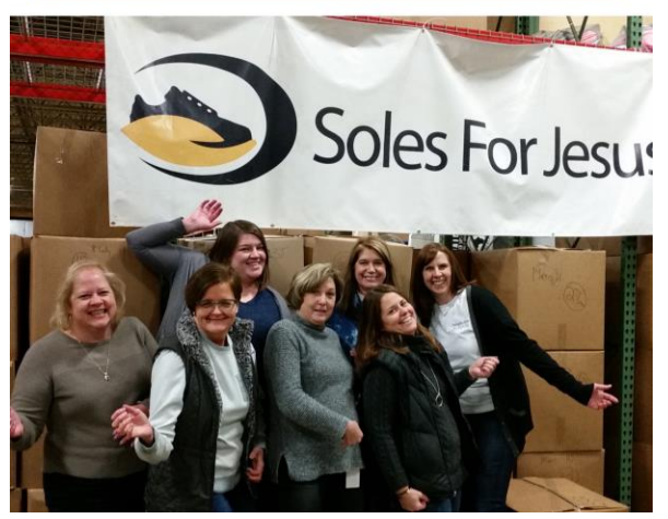
Gallagher Insurance Group volunteering in our warehouse.

November Mailing Volunteers - We are so thankful for volunteers who help us throughout the year with important mailing projects. They are an incredible blessing and we appreciate each of them for their faithfulness in serving!