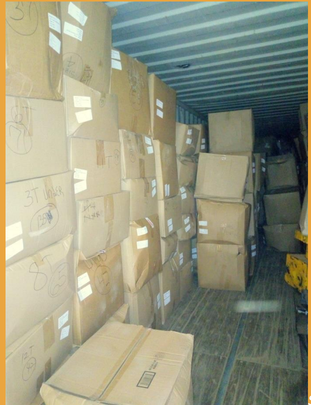
Shoes stored in the warehouse in Liberia.