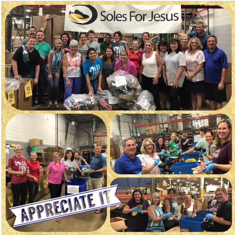
Ellenbecker Investment Group serving in our warehouse.