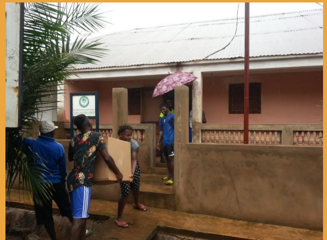
Unloading the shoes at the Every Home for Christ office.