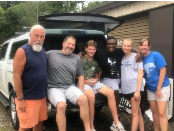
Getting ready to send the shipment from PA to WI.