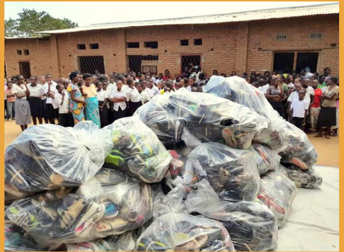
Shoes ready for distribution in Gitaza.

Ellenbecker Investment Group, WI - We are so grateful to EIG for all of their support! First, they started with a shoe drive and their employees responded in a big way by donating over 400 pairs! Their collection box was overflowing with shoes during their entire drive and they also donated funds to help ship them to Africa. Then they came and served in our warehouse and packed over 628 pairs of shoes for shipment! When they arrived to volunteer at our warehouse, it was announced that EIG would be purchasing SFJ t-shirts for each of the 24 employees who came that night. Wow! That was a great surprise and so much fun! We want to thank everyone at EIG for your generosity and compassion to help others in Africa, and for making this partnership such a great success!