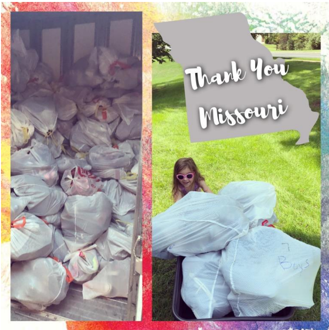
Shoes getting packed and ready to be sent to Wisconsin!