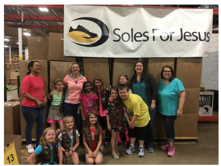
Brownie Troop #10010 serving and dropping off shoes.