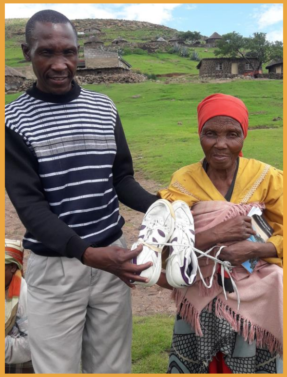
Shoes are opening doors to sharing the Gospel in Lesotho.

View pictures of the Lesotho shipment <u>HERE</u>.