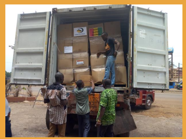
The EHC Guinea Team unloading the shoes.

Christian Youth Theater, WI - We applaud all the parents and kids at CYT for doing a shoe drive, collecting funds and coming in to serve in our warehouse. Your support is making an impact and we thank you for your support. Bravo and job well done!