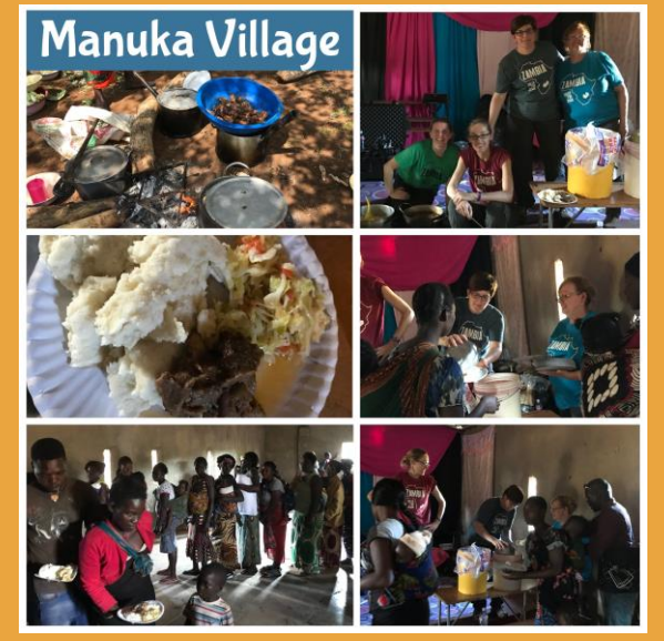
Serving a meal in Manuka Village.

meal is such a special gift and we were blessed to serve it in your honor!