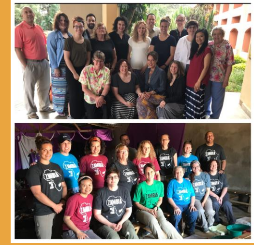
Team Zambia 2018

You can see more pictures from the Zambia mission trip <u>HERE</u>.