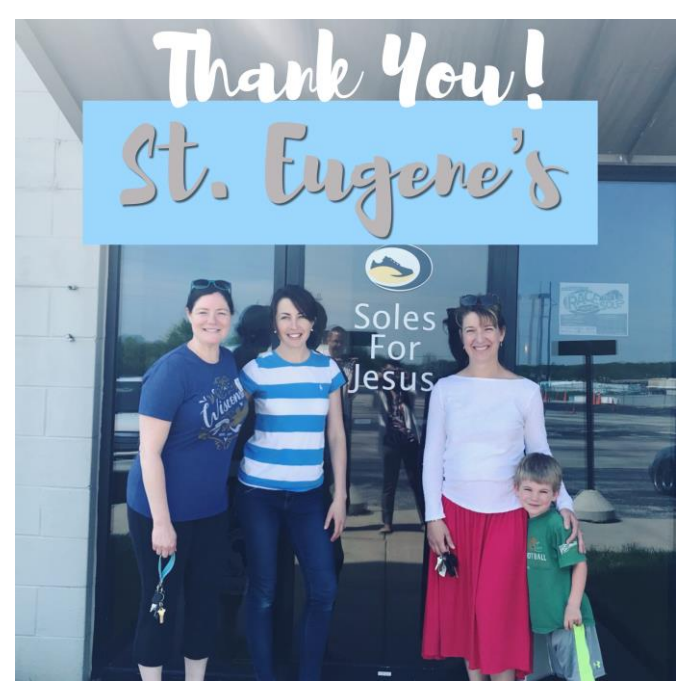
Families from St. Eugene's dropping off shoes.

St. Eugene's Church and School, WI - We thank St. Eugene's Church and School in Fox Point for doing a shoe drive. We appreciate you collecting over 350 pairs of shoes that will be a big blessing to many kids and adults in Africa! We also enjoyed having you come tour our warehouse.