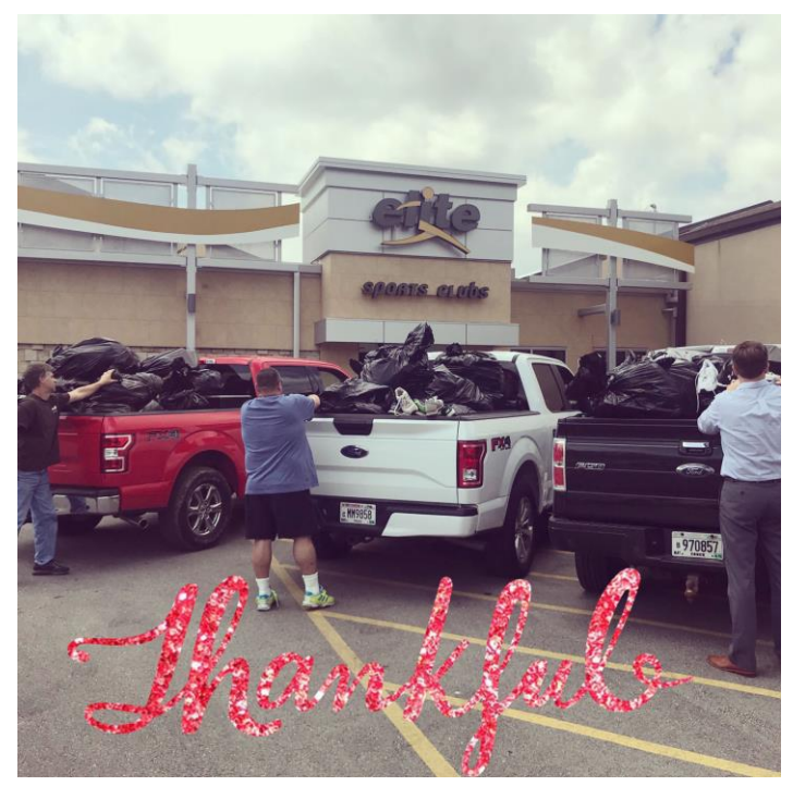
Trucks getting loaded with shoes to deliver to the SFJ warehouse.

St. Eugene's Church and School, WI - We thank St. Eugene's Church and School in Fox Point for doing a shoe drive. We appreciate you collecting over 350 pairs of shoes that will be a big blessing to many kids and adults in Africa! We also enjoyed having you come tour our warehouse.