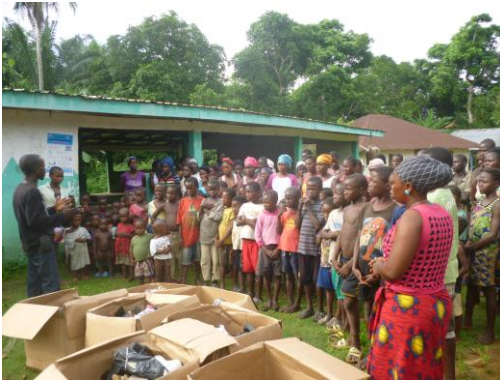
The people of Zohn Village received Jesus and shoes in 2014, and they're still fervently serving Jesus today!