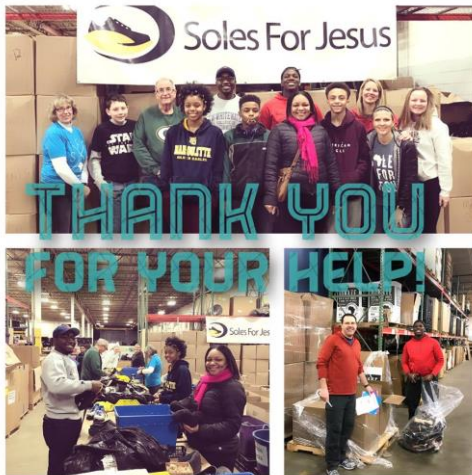
Volunteers from Christ the King Baptist Church at a SOS event.