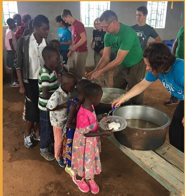
Team Kenya serving a special meal to children who are wearing their new shoes!

Serving a village meal at the end of each day is such a blessing! After a full day of washing feet and sharing shoes it is an absolute joy to serve them a meal, including meat and their favorite things. We can't wait to show you pictures once we return, and you can follow SFJ on social media if you'd like to see them sooner!