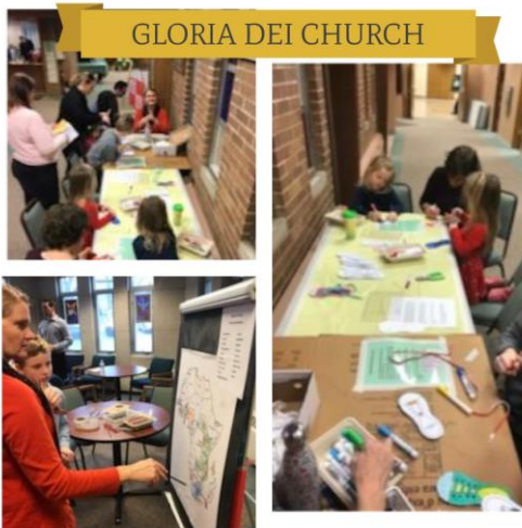
GLORIA DEI CHURCH

to pray for the people in Africa and SFJ. Thank you Gloria Dei for being such a huge blessing!