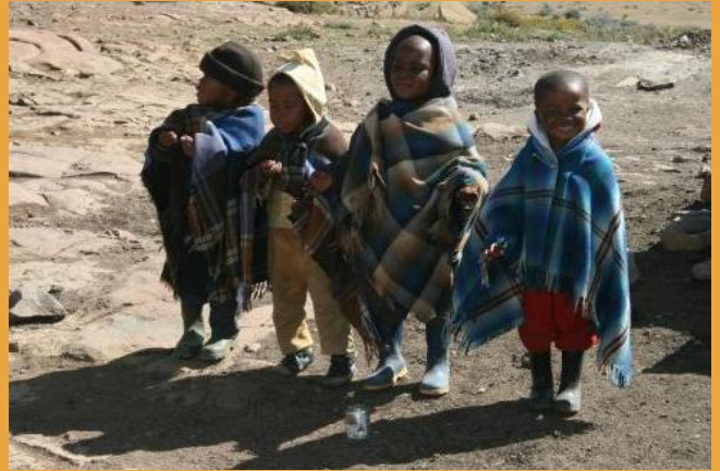
Children in the mountain region of Lesotho where it is cold.

To view pictures of the shipment to Lesotho, click HERE