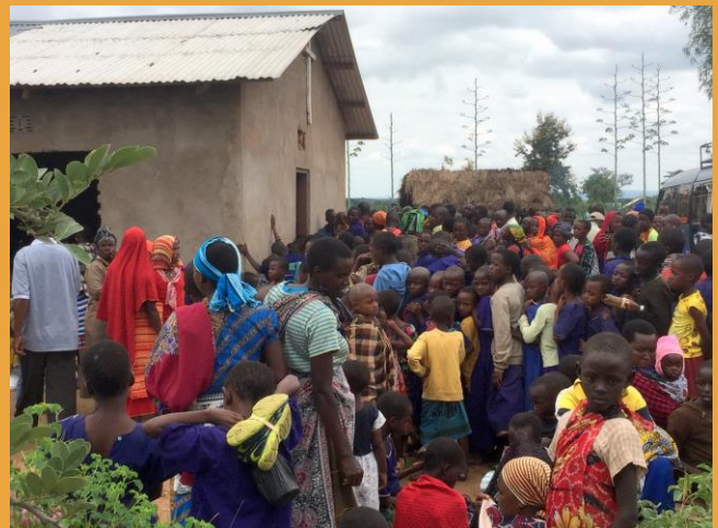
The crowd gathered to listen to the Gospel presentation.

To view more pictures of the shipment to Botswana, click HERE .