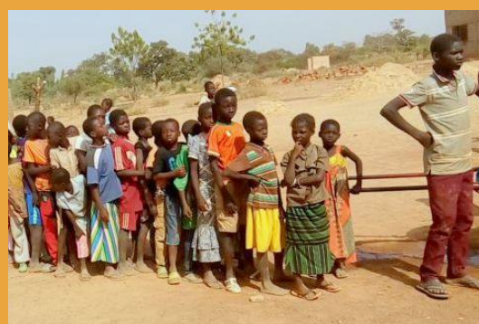
Children in Gambela waiting for their new shoes.

Please keep praying for these new believers as they are being discipled, and for the work of the Lord as shoe distributions continue in this nation. To view pictures of the shipment to Burkina Faso, click HERE