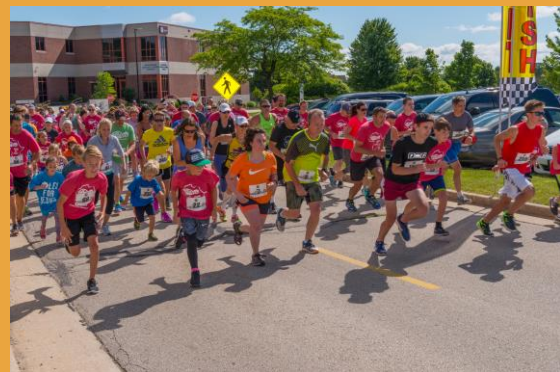
The starting line at the 2017 Race For Soles!

Save the date and tell your friends about our 5th annual Race For Soles on Saturday, June 23, 2018 . We'll be sharing more details soon and we hope to see you there!