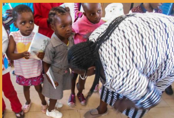
Children in Gabane receiving their new shoes.

reaction, because she rarely smiles and often withdraws from playing with the other children. However, on this day she felt so loved by the gift of shoes that she couldn't stop smiling and having a wonderful time with all the other children." To view more pictures of the shipment to Botswana, click HERE .