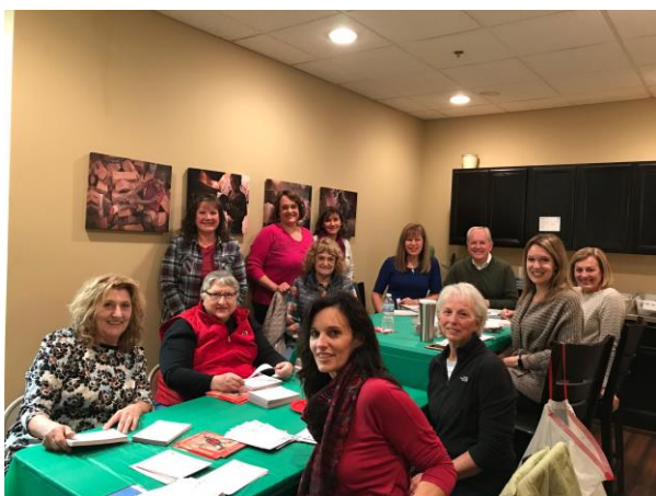
Preparing Christmas cards with our delightful volunteers.

December Mailing Volunteers, WI - We are thankful for our "mailing elves" who helped us spread Christmas cheer by preparing our Christmas cards this year. Thank you for taking time during this busy season to help with our mailing!