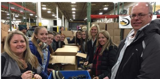
MKE Sting Volleyball team volunteering in our warehouse.