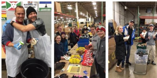
Friends from the Wauwatosa community serving together.