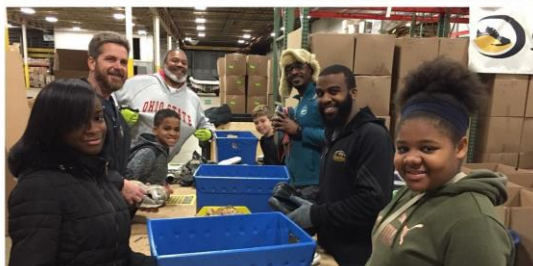
Volunteers from New Song Church working in our warehouse.