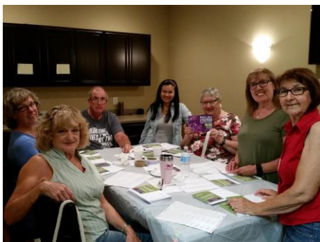
Volunteers preparing our invitations to be mailed.

SFJ Office Volunteers in WI - We appreciate our fabulous office volunteers for helping us prepare and send invitations for our annual Fashion Show Luncheon! Thank you for bringing such joy to our office and for helping us prepare this mailing. If you did not receive one, please send an email to info@SolesForJesus.org and we'd be happy to mail you a personal invitation!