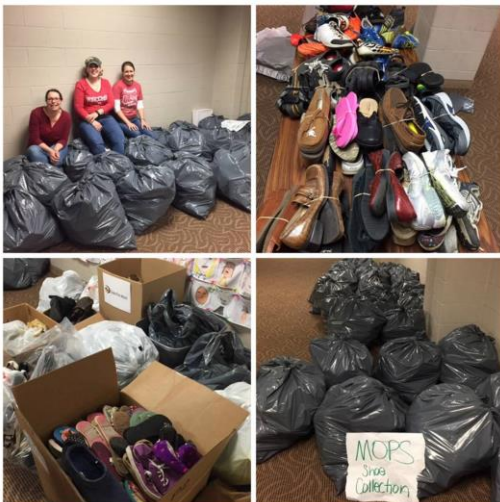
Members of the MOPS group with the shoes they collected.

Liberty Bible Church MOPS Group in Indiana - Special thanks to the MOPS group at Liberty Bible Church, IN, for donating 1055 pairs of shoes for Africa! Multitudes will be blessed because of your generous donation!