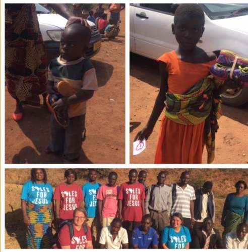
We're grateful for this fabulous team serving in Malawi.