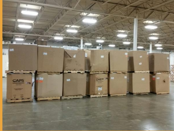
Another 5,000 pairs of shoes just arrived from PA!

Yenh at New Song Church in WI - What a blessing to be a part of the Sunday morning service at New Song Church! Yenh enjoyed sharing our mission of God's love through shoes!