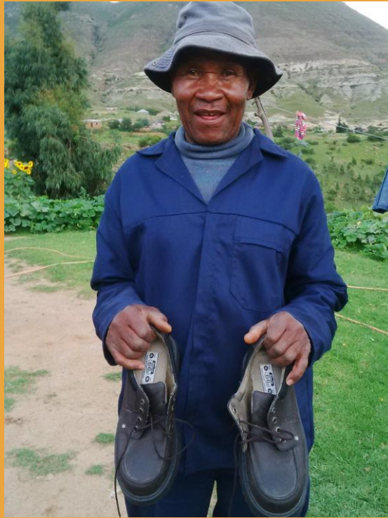
Extremely thankful for his new shoes!