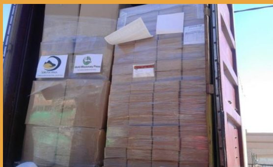
Opening the shipping container for the first time at the Every Home for Christ Botswana Office.