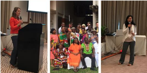
Every Home for Christ Conference in Seychelles, Africa