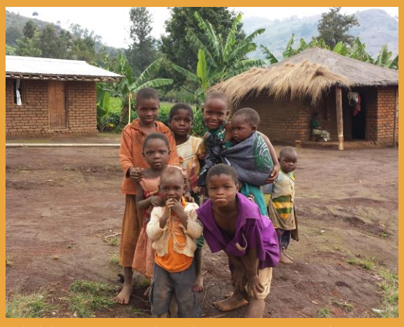
Children in rural Malawi awaiting shoes.

View pictures of the shipment to Malawi HERE.