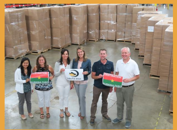
SFJ Board of Directors with the shipment of shoes and Gospel booklets for Burkina Faso.

Tables & tickets go ON SALE: Thursday, August 17 @9am!