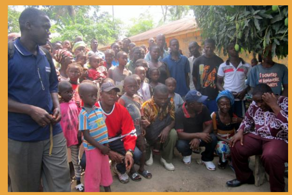
Many are eager to hear the message of God's love.

You can view more pictures of the shipment to Liberia <u>HERE</u>.