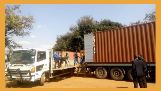
8,000 pairs of shoes being offloaded in Lilongwe, Malawi!

View pictures of the shipment to Malawi HERE.