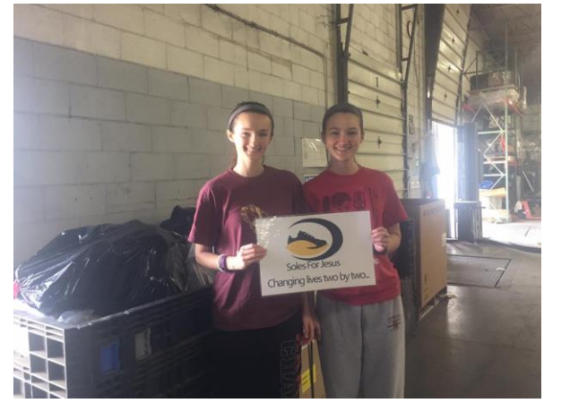
Sussex Hamilton students with their shoe delivery.

Sussex Hamilton High School in WI - Thank you, Sussex Hamilton High School, for all of the shoes that you donated for Africa! And thank you for delivering them to our warehouse, girls.