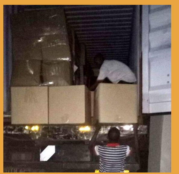
Dur first shipment of shoes arrived in Ghana!

Auction items: We are extremely grateful for