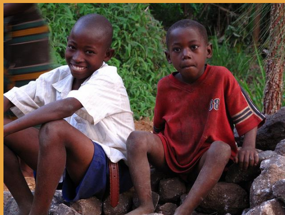
Young boys eagerly awaiting the shoes' arrival!

We are thrilled to share that our first shipment to Uganda arrived in Kampala! Please pray for the container to quickly clear the customs controls. We are excited to start receiving reports of ministry work being done. Please continue to pray for God to open people's hearts to the truth of the Gospel. You can view pictures of the Uganda shipment HERE .