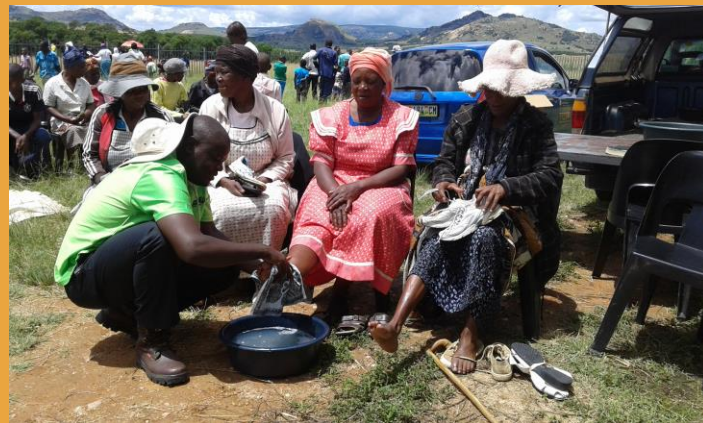
Serving precious ladies with the love of Christ!