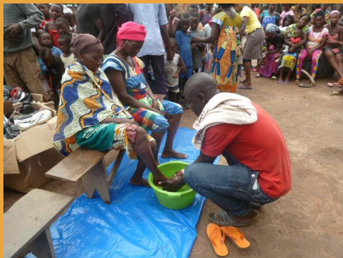
A young man being the hands and feet of Jesus.

You can view pictures of the Lesotho shipment HERE .