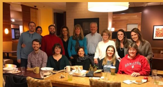
Team Tanzania enjoying a sweet reunion.

Stay tuned next month, as we share where our next mission trip will be in May of 2018!