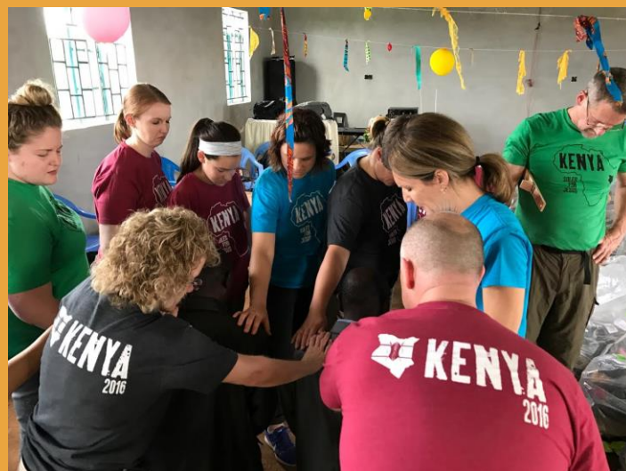
Team Kenya praying over village pastors.

"Therefore I tell you, whatever you ask in prayer, believe that you have received it, and it will be yours." Mark 11:24