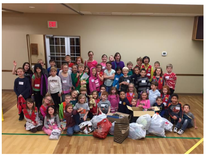
The students of Mequon Aliance Awana with the shoes they collected.