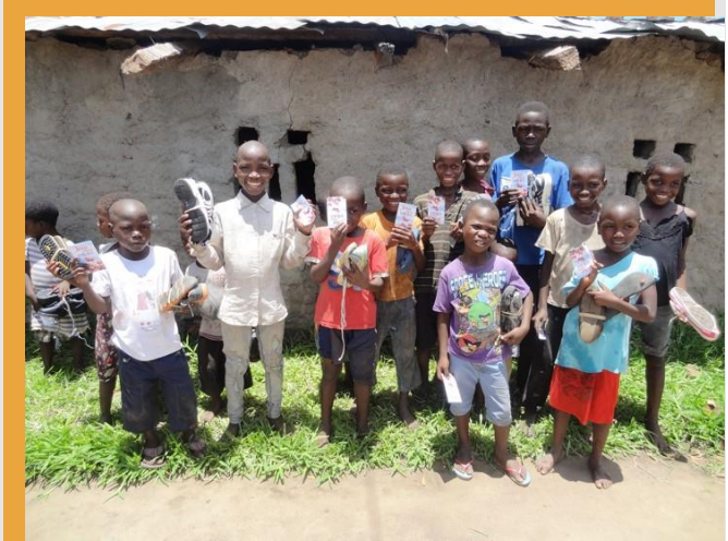
Children in Mozambique with their new shoes and gospel booklets.

Hearing these and other testimonies are what drives us to serve God's kingdom! To God be the glory!